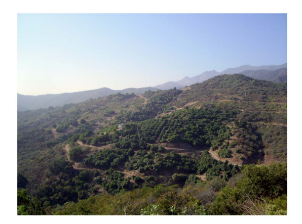
Figure 2. Orchard on hillslope. Typical landscape pattern of steep hills with orchards surrounded by wildlands. doi:10.1371/journal.pone.0068025.q002

were placed in and around 6 orchards (22 sites in orchards and 6 sites in natural vegetation adjacent to orchards) and 2 continuous wildlands (10 sites), with distance to nearest camera between 30-900 meters (mean = 193 meters).