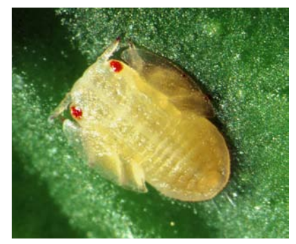
Figure 7. 5th instar psyllid nymph.

Citrus greening disease was first detected in the United States in Florida in 2005. It is found throughout Asia, the Indian subcontinent and neighboring islands, the Saudi Arabian peninsula, and since 2004 in the São Paulo state of Brazil. The citrus greening pathogen is transmitted by psyllid vectors, grafting, and possibly by citrus seed. A disease-free citrus budwood program combined with detection and eradication of Asian citrus psyllid are essential components of the program that protects the California citrus industry from citrus greening disease.