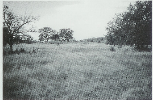
View from entrance walkway; entrance walk; wildflower center site with native grasses and oaks; site plan

Graphic: Darrel Morrison, Eleanor McKinney, Bob Anderson