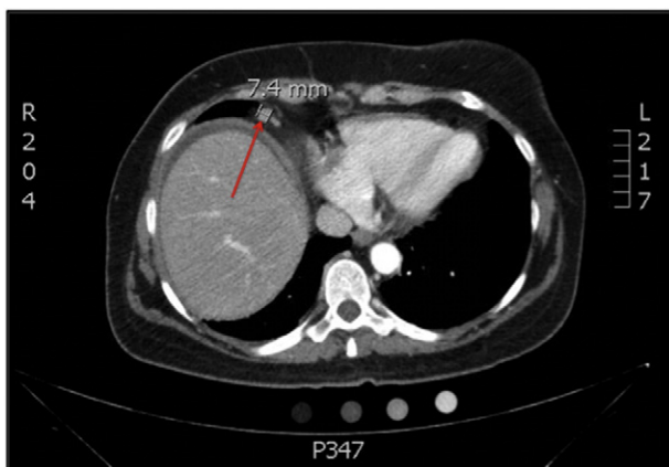
Fig. 1. Computed tomography imaging of the chest from Case #2 illustrating an enlarged 7.4-millimeter cardiophrenic lymph node indicative of metastatic disease.

In conclusion, cardiophrenic lymph node metastasis, defining Stage IV-B ovarian cancer, is extremely rare in low-grade serous ovarian carcinoma. We have presented two cases that bring to light the importance of pre-operative imaging and astute physician awareness to this unique disease pattern. Given high chemotherapy resistance, surgical cytoreduction for patients with low-grade serous carcinoma will remain