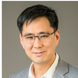
Jun Huh Harvard University