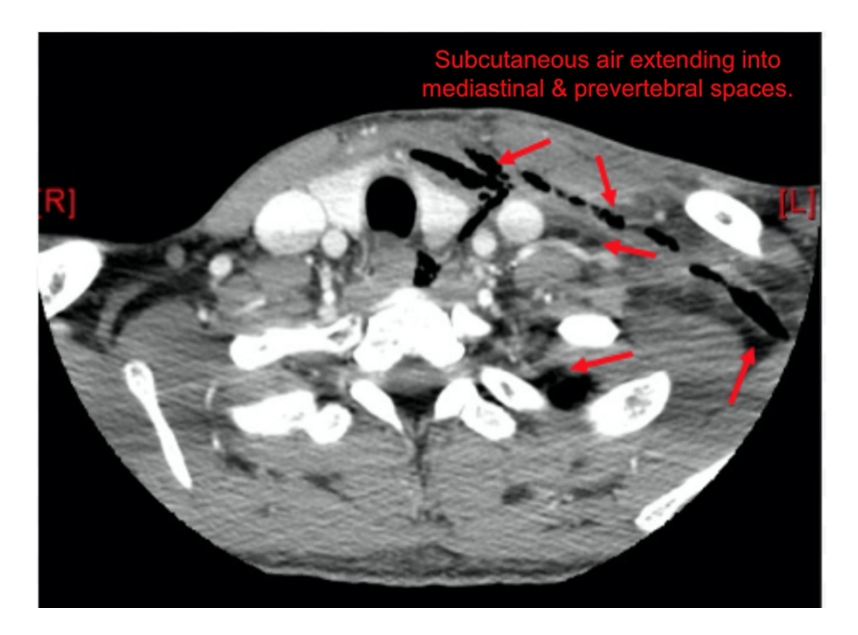
Axial CT Video Link: <u>https://youtu.be/aqTOSnGU0vg</u>