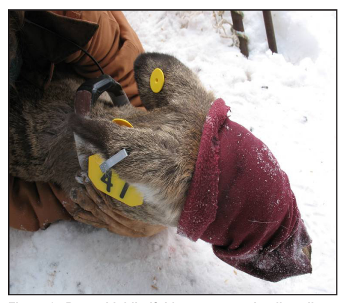
Figure 6. Deer with blindfold, ear tags, and radio collar.

and cattle. Spatial analysis on deer locations relative to livestock management practices and farm structures will take place when all data is retrieved in late 2008 and early 2009. Once complete, we hope this information will allow us to recommend mitigating measures for livestock producers to reduce the risk of transmission of bTB from free ranging white-tailed deer to domestic cattle.