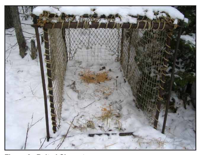
Figure 3. Baited Clover trap.

in high fenced areas, and storing supplemental feed in a closed barn. One study site has been previously infected with bTB, and 3 of the study sites are in close proximity to infected or previously infected farms.