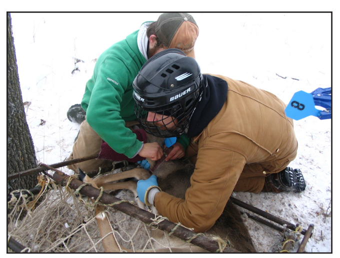
Figure 4. Restraining a deer captured in a collapsed Clover trap.

Deer were trapped from 19 January to 16 March 2007 and from 5 January to 5 March 2008 using collapsible Clover traps (Figure 3). Traps were baited with shelled corn soaked in molasses and checked daily after 8:00 A.M. If overnight temperatures were forecasted below -17.8°C, traps were closed for the night. Captured deer were physically restrained or restrained by collapsing the trap (Figure 4). Upon capture, deer age (fawn vs. adult) was determined from body size and structure. Adult and yearling deer were