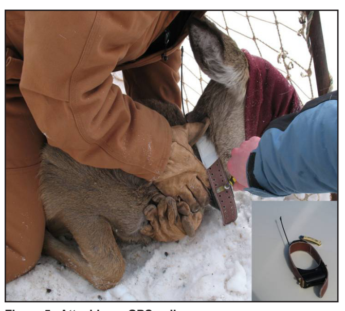
Figure 5. Attaching a GPS collar.

fitted with uniquely colored and numbered ear tags and a radio collar equipped with a global positioning system (GPS) (Figures 5 and 6) (Advanced Telemetry Systems, Inc., Isanti, MN). Each GPS collar is programmed to record a location every 2 hours for 1 year after activation before dropping off. Deer are tracked bi-weekly using VHF telemetry to monitor for mortalities and determine whether deer are remaining on or near study sites.