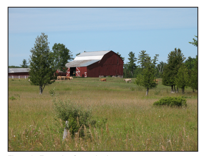
Figure 2. Example of a study site.

Study sites are beef cattle farms ranging from 30-160 ha in and around DMU 452. Each farm manages ≥20 cattle annually and includes wooded areas that serve as cover and winter deer habitat (Figure 2). All farms use similar feeding and management practices, including pasturing cattle during the summer, storing hay bales