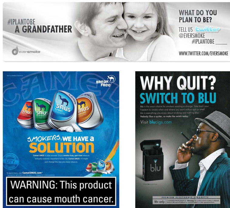
Figure 1. An advertisement for Eversmoke electronic cigarettes ( http://ecigexperts.co.uk/eversmoke ), blu electronic cigarettes ( https://trinketsandtrash.org/detail.php?artifactid=6991&page=1 ) and Camel snus ( https://trinketsandtrash.org/detail.php?artifactid=6926&page=1 ) that seem to be capitalizing on hope.