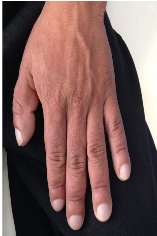
Figure 3. Skin thickening along the dorsum of the hands predominating overlying interphalangeal joints, with acropachy and pseudo-leukonychia.

A 30-year-old man presented with a one-year history of progressive skin thickening of the scalp and face (predominantly along the frontal and nasogenian areas) that created a noticeable increase in furrows, in a manner akin to cutis verticis gyrata .