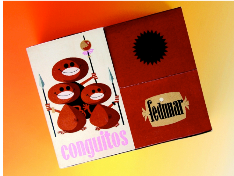
Figure 1. Conguitos logo

Even though Tudela Férrez naturally fixated on the Congo in choosing a name for the product because of its presence in the media, it would have been logical to actually focus his attention on Equatorial Guinea for a number of other reasons. While the Congo was a former colony of Belgium whose natural resources included uranium, cobalt, and diamonds, it was in fact Equatorial Guinea which was a colony of Spain and which actually produced cocoa prior to its independence in 1968 (N’gom and Ugarte 109). Given that the Spanish government subsidized cocoa production in Equatorial Guinea after the Spanish Civil War (109), it was clearly in Spain’s interest as an autarky to increase Spanish consumption of, and consequently advertising for, cocoa-related products. Thus, the Conguito could serve as an alter ego for the Spanish African colonial subject from Equatorial Guinea. 4 Moreover, given that imperialist nostalgia may be the strongest precisely when an empire is most in decline, the end of Belgium’s colonial rule in the Congo could open the door to discussions about Spain’s colonial past, present and future.