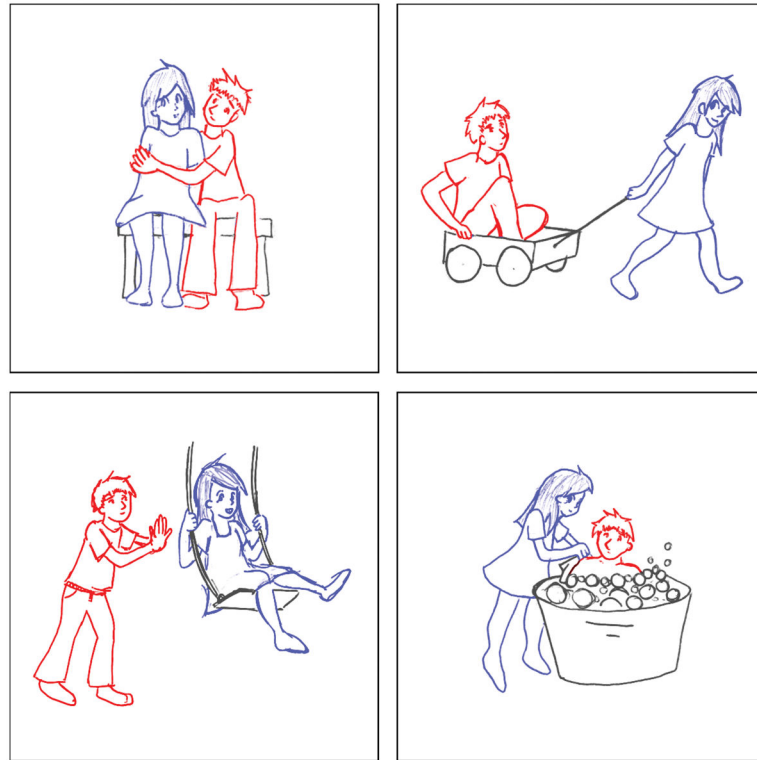
Figure 1. Examples of stimulus pictures.