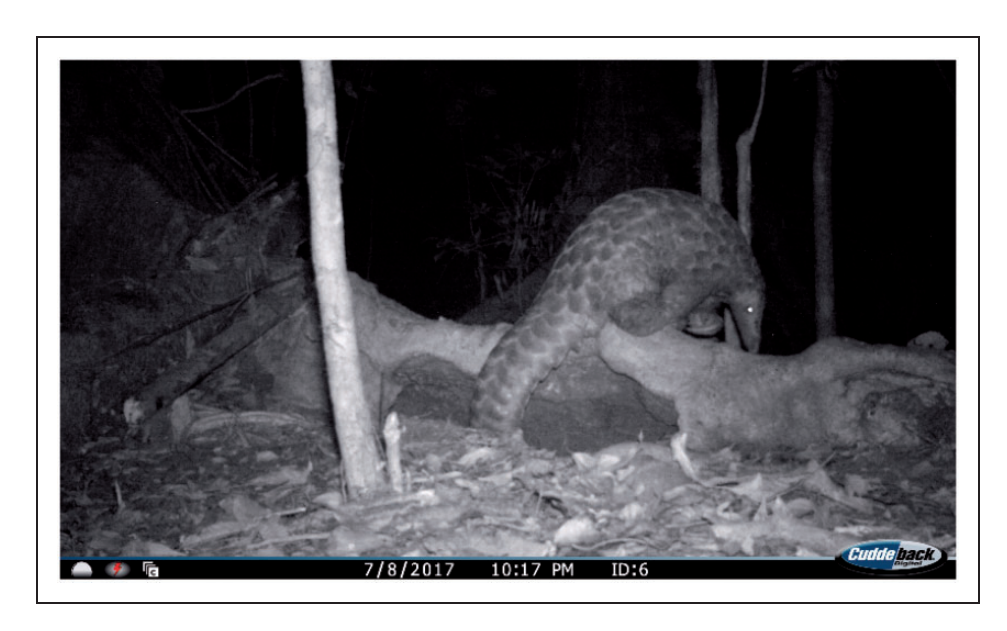
Figure 2. Giant pangolin photographed by camera trap leaving a burrow at Bouamir Research Station in the Dja Biosphere Reserve, Cameroon.

One camera trap out of nine at eight localities (two burrow entrances were associated with a single tree) photographed a pangolin at a burrow in this survey (Figure 2). The burrow was adjacent to a tree located on a northeast facing slope at the edge of a swamp. The tree had multiple burrow entrances around its trunk and roots, and cameras were placed to capture