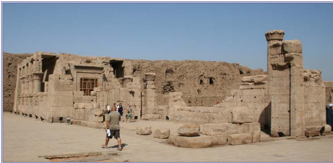
Figure 4. Birth house of the Temple of Edfu.

sanctuary is furnished with a false door and a cult niche. The ambulatory merges with the entrance kiosk, which is a novelty (Arnold 1999: 257).