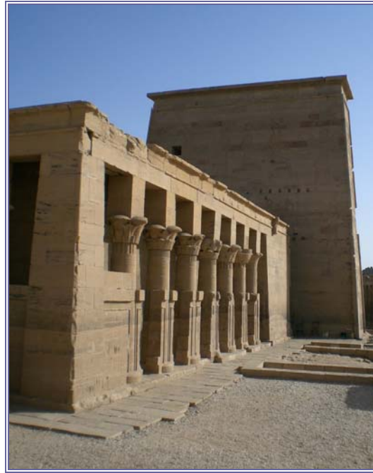
Figure 2. First pylon and mammisi at Philae.

The sanctuary can be divided into two rooms, as is the case in the late Ptolemaic mammisi of Armant (Daumas 1977: 464). This building with two columned high kiosks in front of the sanctuary (Arnold 1999: 223; reconstruction in Arnold 1998) is somewhat unusual in terms of its architecture (Daumas 1958: 100). Perhaps its construction was already started under Ptolemy XII Neos Dionysos, whereas cartouches of Cleopatra VII and Ptolemy XV Caesarion testify to decoration activity under his daughter and grandson. According to Daumas, the