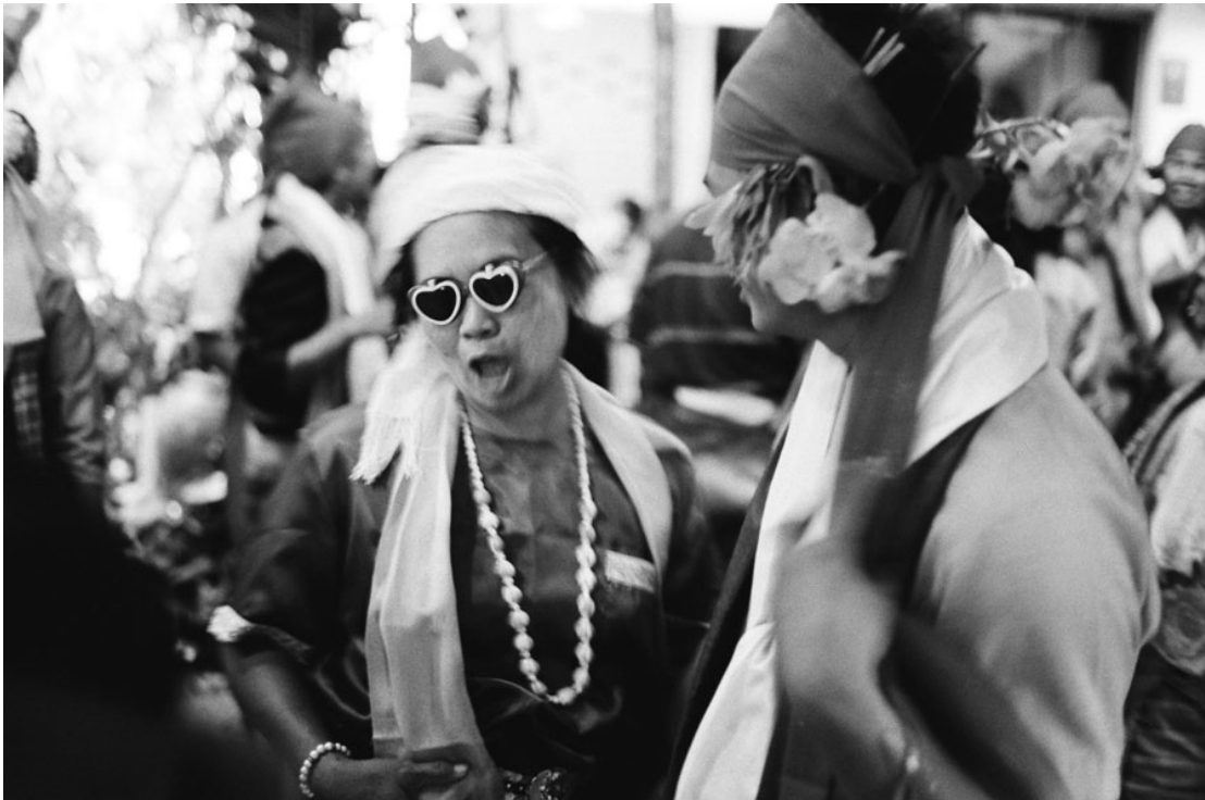
Spirit medium, Chiang Mai, Thailand, 2010

In the 28 years since I first stepped into that classroom, I've never stopped photographing, and I still use an SLR. I still get as close as I can to my subjects, frame them as exactly I can, and focus as clearly and quickly as I can on what I feel in that moment are their most engaging qualities. I also know it's all in vain.