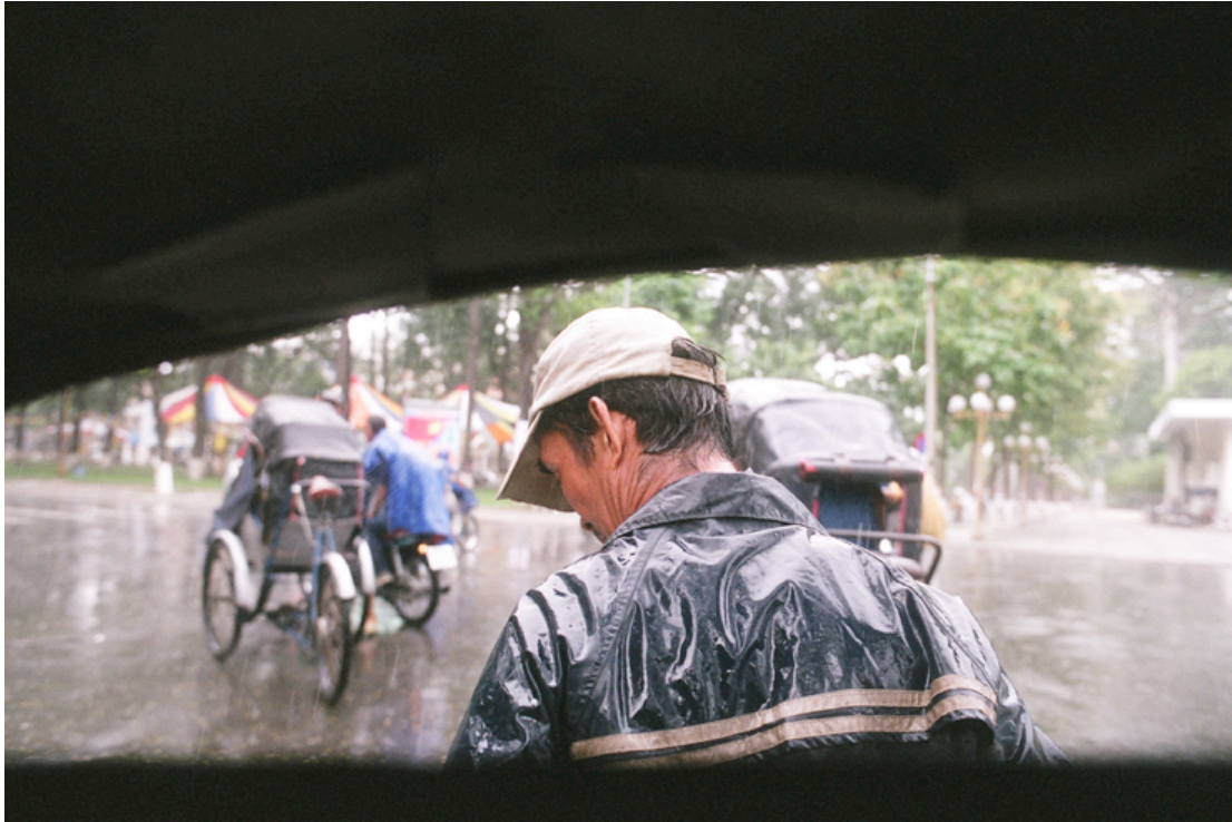
Fig. 2. Cyclo driver, Saigon, 2005.

My life has moved me in many directions. I am taken along its path, and it has driven me to laughter, tears, joy, despair, and utter longing for what is both possible and impossible. This yearning also drives me onward, into a realm of perspective, viewing, framing. Throughout my life, every moment of such longing has brought me to the brink of the mystery of my own life. This is the reason I photograph.