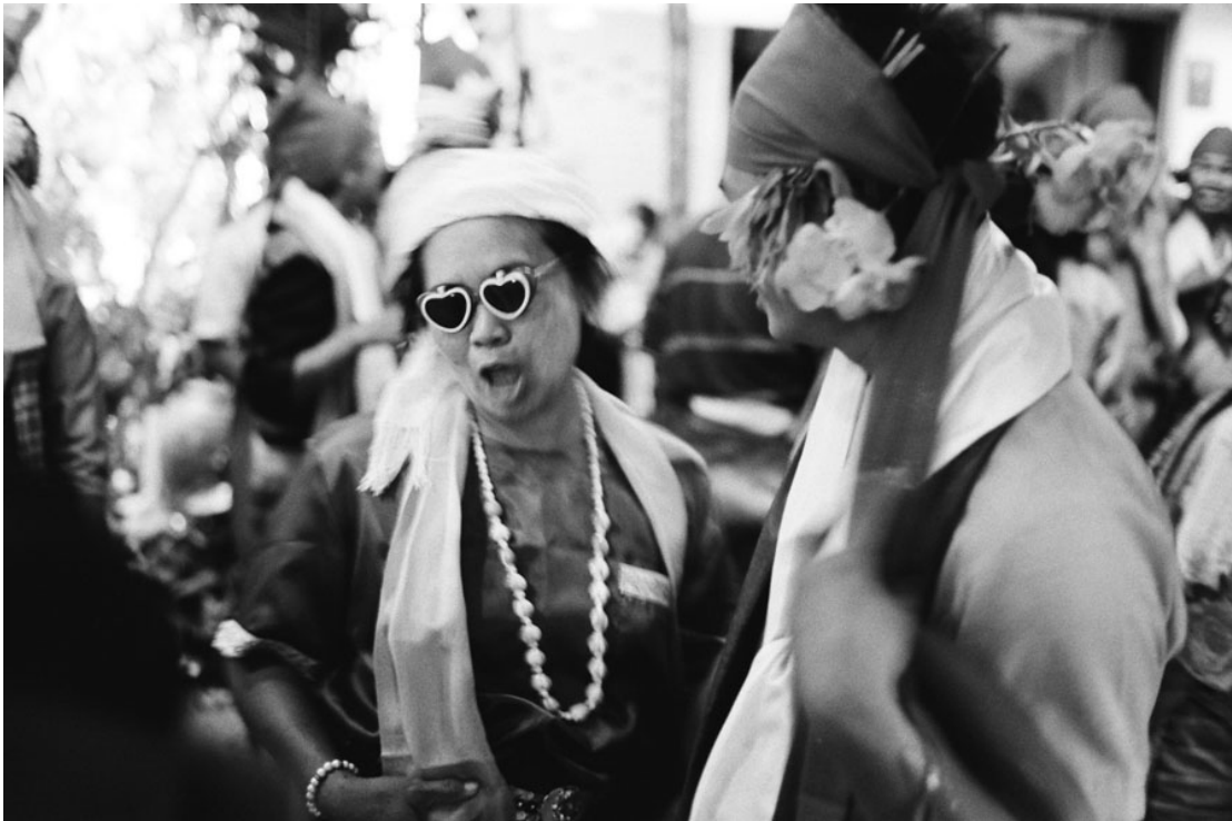
Spirit medium, Chiang Mai, Thailand, 2010

In the 28 years since I first stepped into that classroom, I've never stopped photographing, and I still use an SLR. I still get as close as I can to my subjects, frame them as exactly I can, and focus as clearly and quickly as I can on what I feel in that moment are their most engaging qualities. I also know it's all in vain.