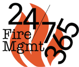
Figure 1 (cont'd). Fire Management 24/7/365: the workshop program, Day 2.