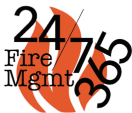
Figure 1. Fire Management 24/7/365: the workshop program, Day 1.