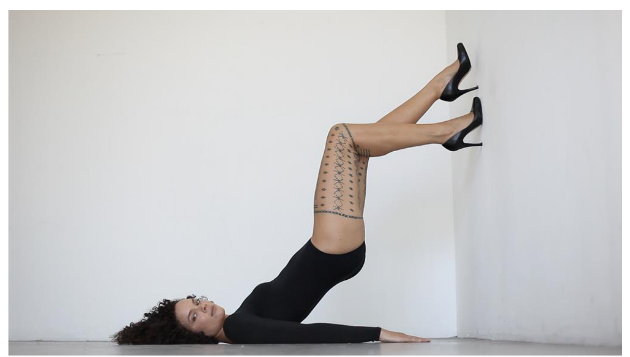
Figure 5. Angela Tiatia, Walking the Wall , 2014. Single-channel, high-definition video with sound, 13:04 minutes. Courtesy of the artist and Sullivan+Strumpf, Sydney | Singapore