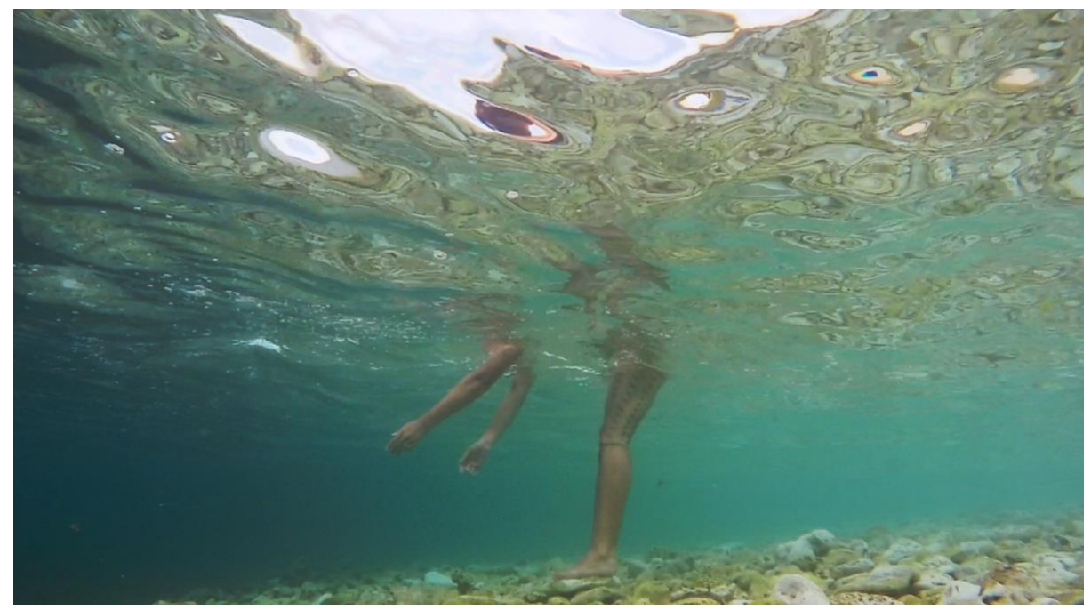
Figure 1. Angela Tiatia, Lick, 2015. Single-channel, high-definition video with sound, 6:33 minutes. Courtesy of the artist and Sullivan+Strumpf, Sydney | Singapore

Keywords: contemporary Pacific art, Angela Tiatia, climate change, decolonial theory, environmental performance, survivance, Indigenous feminist Pacific