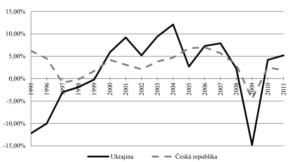
Figure 2 GDP Growth: Ukraine and the Czech Republic (1995 – 2010)