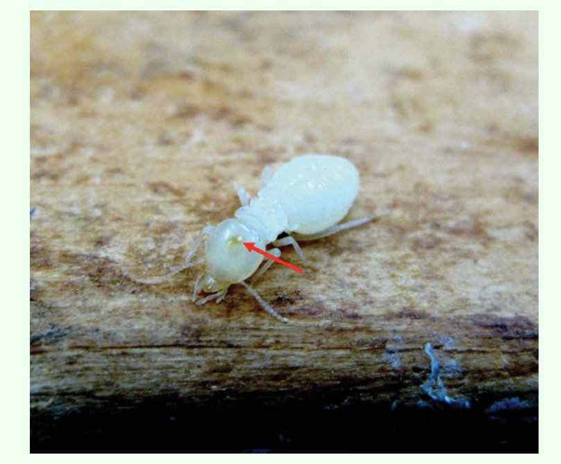
Figure 4. Parasitized Macrotermes carbonarius presoldier. A tiny dot (mouth hook of a larval parasitoid) can be seen inside the head capsule of the pre-soldier. High quality figures are available online.

were parasitized. However, none of the mature workers or L3 and L4 stages was parasitized.