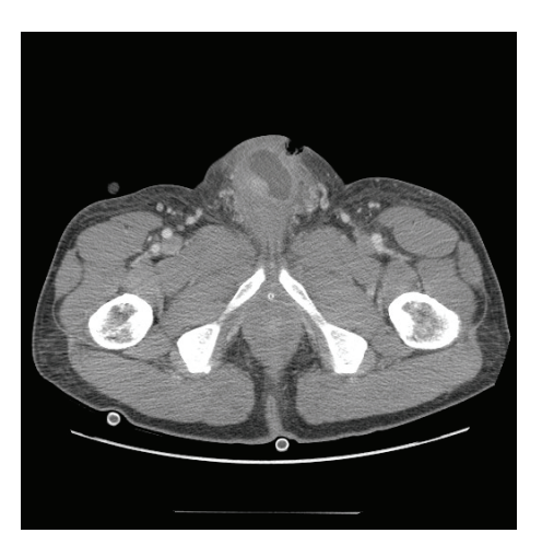
FIGURE 1: Contrast CT scan of the pelvis of Case 1. CT scan showed abscesses within or adjacent to the bilateral corpus cavernosa. The largest abscess was located in the left corpus cavernosum, measuring 4.8 \times 2.8 \times 4.4\,\mathrm{cm} . The additional left corpus cavernosum and right corpus cavernosum abscesses measured 2.4\,\mathrm{cm} and 1.6\,\mathrm{cm} , respectively, in longest diameter on coronal views.

Despite negative CT imaging, the patient was immediately taken to the operating room for incision and drainage after progressively worsening in the emergency department. A 17-French flexible cystoscopy confirmed no evidence of urethral erosion, injury, or stricture. After placement of a Foley catheter, a 7 cm incision along the right lateral aspect of the penis was performed whereby pus was drained. The abscess cavity was copiously irrigated and packed wet to dry. There was no involvement of the corpora or urethra. His postoperative course was complicated by pulmonary edema managed conservatively with diuresis. Initially, he was started on vancomycin (1.5 g every 8 hours) and ertapenem (1 g IV every 24 hours) antibiotics until his intraoperative wound culture grew sensitive Group A Streptococcus spp. He was discharged home with amoxicillin/clavulanate 875 mg/125 mg twice daily for 14 days based off antibiotic sensitivities.