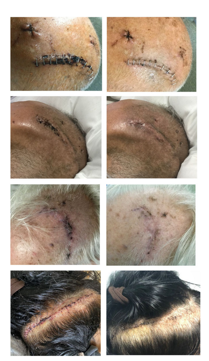
Figure 1. Examples of pre-intervention and post-intervention craniotomy wounds during photo-documentation monitoring.

(0.9, 3.0), p = 0.08) were associated with increased odds of SSI. In multivariable analysis, the wound care intervention remained significantly associated with reduced SSI while procedure duration, and emergent or trauma-related surgery remained positively associated with SSI (Table 3).