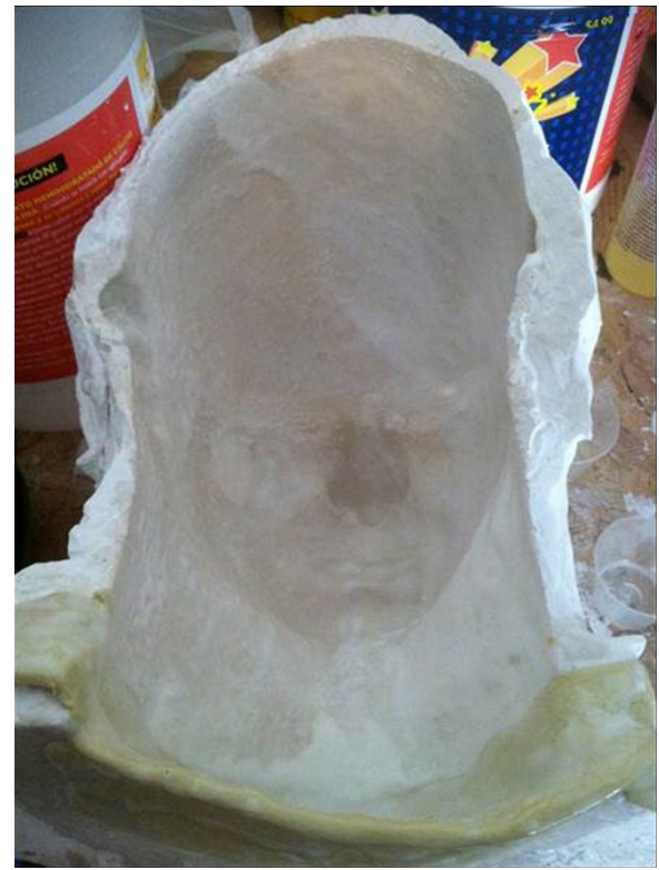
Figure 1. Reverse mold created with Plaster of Paris on a foam wig stand.