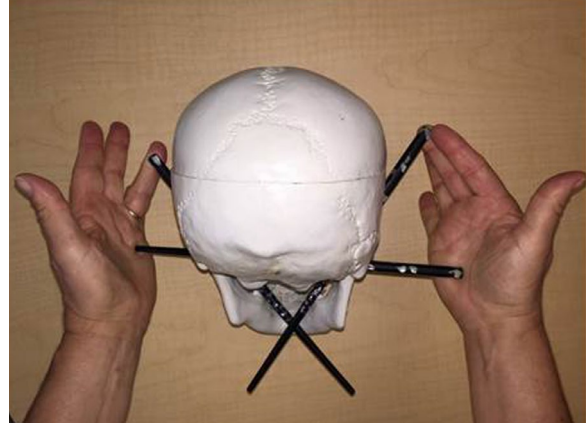
Figure 2a. Preparing the skull with chopsticks.