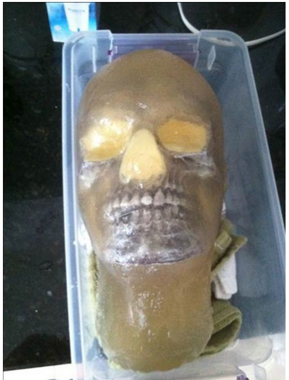
Figure 3. Final product is the gelatin facial mask after it has been removed from the reverse mold and reapplied to the skull.