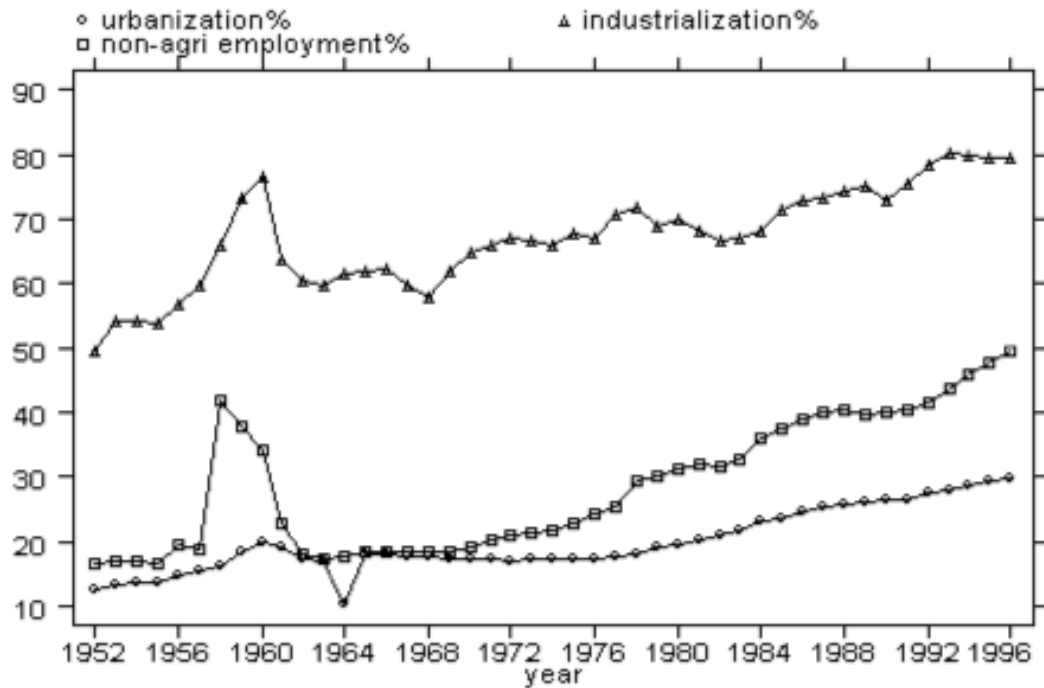
Fig. 1. Industrial Output, Industrial Employment, and Urbanization: China 1952-1996