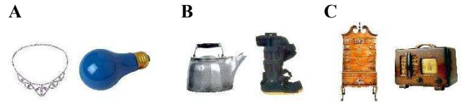
Figure 1: Objects from a typical mixed trial. (A) low-similarity, (B) medium-similarity, and (C) high-similarity distractors, as ranked to the teddy bear target category.

Two conclusions follow from our data. First, categorical search guidance is affected by target-distractor visual similarity. As the visual similarity between a distractor and a target category increases, search efficiency decreases. This decreased efficiency is due to distractors becoming more distracting, as evidenced by an increase in the number of first fixations on the high similarity distractors. More generally, this finding adds to the growing body of evidence suggesting that categorical search is indeed guided (Schmidt & Zelinsky, 2009; Yang & Zelinsky, 2009), a question that