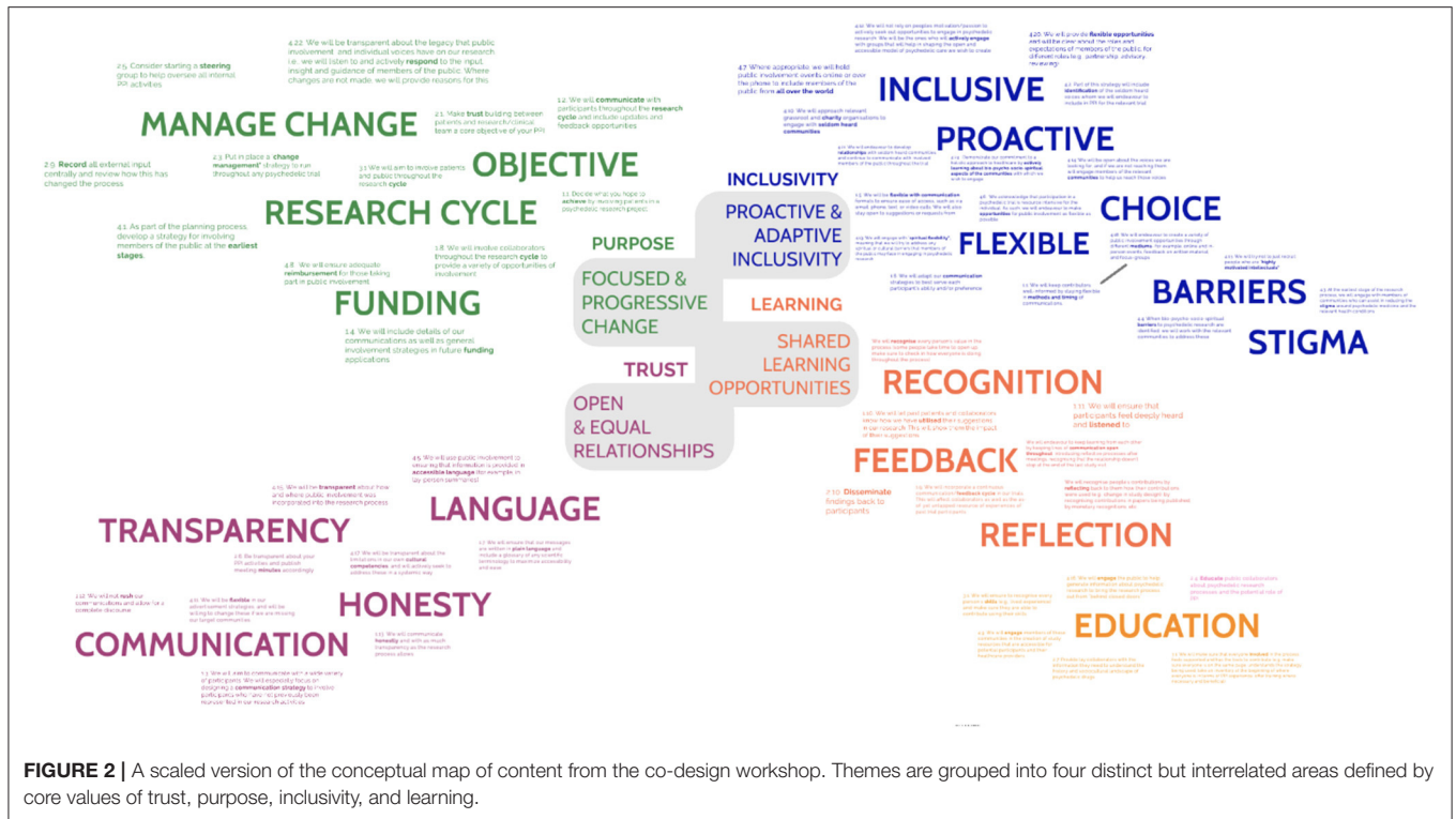
FIGURE 2 | A scaled version of the conceptual map of content from the co-design workshop. Themes are grouped into four distinct but interrelated areas defined by core values of trust, purpose, inclusivity, and learning.

theory and could also be co-produced with specific populations in mind.