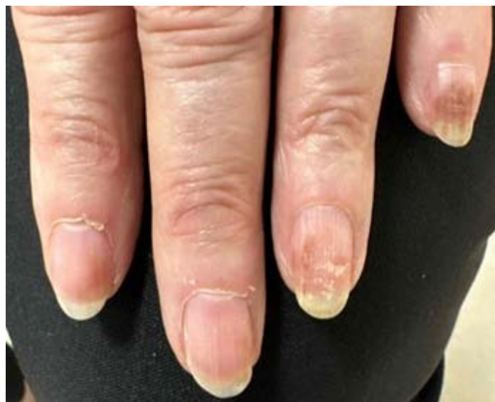
Figure 1. Poorly defined, muddy brown subungual pigment including longitudinal splinters can be seen on the distal nails of multiple digits.

injections effectively controlled the bleeding, allowing discontinuation of bevacizumab therapy without recurrence of hemorrhage. However, eight months later, the patient began experiencing blurry vision in her right eye, ultimately leading to a diagnosis of bilateral exudative age-related macular degeneration. This prompted the resumption of bevacizumab injections, now in both eyes. Once again, the hemorrhage stabilized with treatment and therapy was withdrawn, only for the hemorrhage to return three years later. Bilateral bevacizumab 1.25mg injection therapy was resumed again in three dose cycles, but this time with increased injection frequency every 4-6 weeks. Six months into the patient's third round of treatment, she noticed discoloration on her fingernails after receiving an increased dose of 2.5mg bilaterally. She denied tapping, hitting, or otherwise traumatizing her nails. Although the proximal 3-4mm of all nails appeared normal, digits three through five on the left hand and digits four and five on the right displayed a muddy