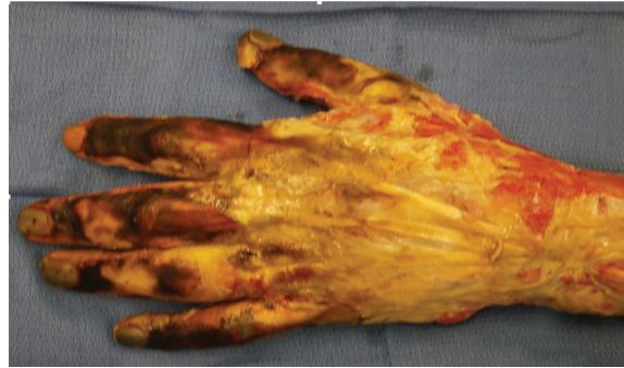
Fig. 1: Intra-operative image of the left hand and distal forearm, extensor aspect.

After further examination, the forearm deemed to be unsalvageable and due to concerns of worsening septic shock with the risk of hematogenous dissemination of the mold, he underwent left below elbow amputation and placement of a split thickness skin graft. Soon after the surgery, his clinical status showed remarkable improvement enabling weaning the vasopressor support and resolution of his sepsis. The rest of his hospital course was uneventful, the left upper extremity stump showed successful recovery and engraftment (Figure 4). He was