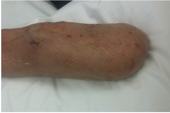
Fig. 4: Appearance of the left upper stump at discharge.

the clinical status with aggressive deep tissue invasion, progression of necrosis and distant dissemination. The mortality was almost universal. 9-11 Diagnosis of these infections begins by having a high clinical suspicion. Several risk factors have been identified that predispose to develop invasive fungal infections including increasing burned TBSA, length of hospital stay, polymicrobial infections and the presence of inhalational injury. 4,5