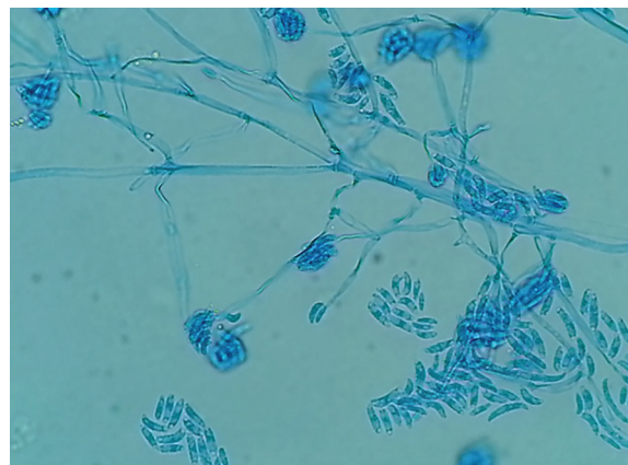
Fig. 3: F. solani under light microscopy with a lactophenol cotton blue stain.

discharged to an inpatient rehabilitation center for further physical therapy.