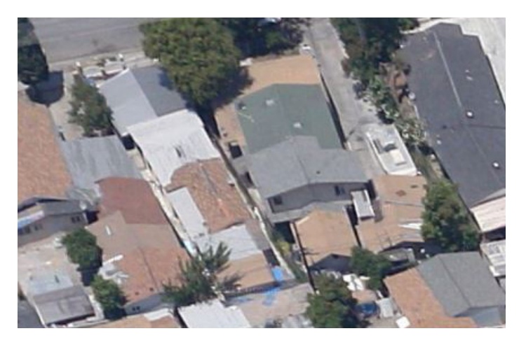
Figure 2. An Example of Unpermitted Housing Covering the Open Space on Residential Lots, Florence-Firestone.