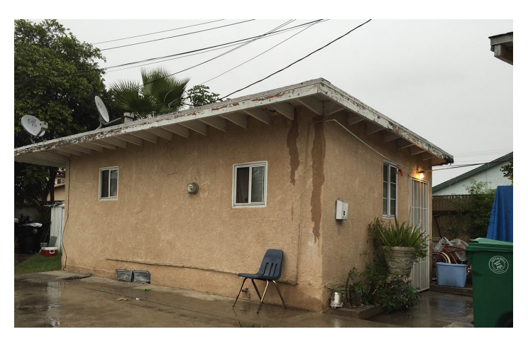
Figure 3. Unpermitted Back House in Lynwood.