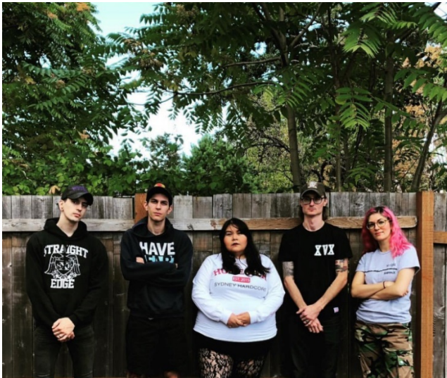
(Figure 7, WithxWar, Tish)

In the Seattle/Portland area, artist Black Belt Eagle Scout (Swinomish/Inupiaq) is a queer feminist, musician, and producer. Black Belt Eagle Scout developed a love for grunge music, riot grrrl (feminist punk), D.I.Y. shows, and views that music is a way to build. 239 She calls on white riot grrrl to stand up for Indigenous women and bring them into the conversation. Black Belt Eagle Scout has recently gone on tour posting Indigenous ancestral names and places for her dates on flyers, reclaiming presence and that land is Indigenous land. “When I say, “Indians Never Die,” I mean it is a metaphor in the way that we’re going to be here caring for the land. Even though you kill us, we’re going to be here caring for the land,” exclaims Black Belt Eagle Scout. 240