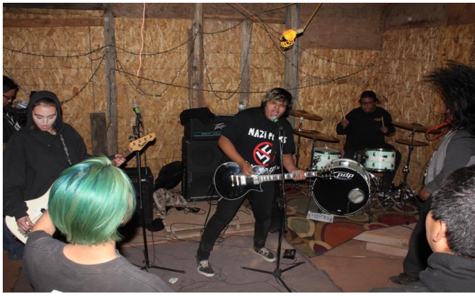
(Figure 9, the Ferrets, the Ferrets Facebook)

In examining survivance, Indigenous bands and musicians have been creatively building communities using punk aesthetics of D.I.Y. for venues, warehouses, skateparks, studios, backyard shows, despite rural areas and limited resources imposed by U.S Government. There are also desert festivals and house shows thrown by bands and promoters in the D.I.Y. fashion. In the case of some Indigenous communities from more rural, desert areas, they have had difficulties due to location that ranged from rationed internet, to gigs and shows that were far