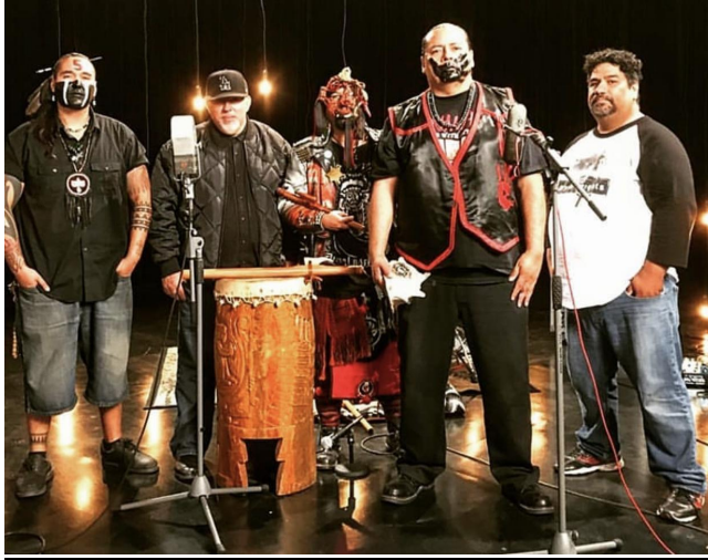
(Figure 5, Aztlan Underground, Yaolt)

Dolls continue to talk about ecological rights and empowering the youth through punk and guitar.