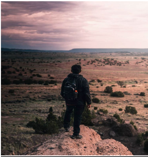
(Figure 16)

has a box full of flyers from local shows and the scene from 2003-2009. “Native punk is its own thing, people might have a preconception, but if people took the time to hear every genre out there, and be open minded, the songs have a deeper meaning and we use anime as a medium not just trying to throw it out there, but little nods.” 427 Rei Gurren is self-taught, with no vocal coaches, and very D.I.Y. Through punk mixed with the medium of Japanese anime, the band creates a network for those suffering loss, anxiety, frustrations, and hardship. It is a form of survivance that can combat anxiety, depression, pain by creating art, and succeeding in whatever you want to do. The band’s mark on music is “to be mentioned years from now, how they helped others, and to not self-harm or do something stupid the way bands like Rise Against has influenced them,” says Rueben. 428 Rei Gurren keeps doing what they want to do and by having fun, enjoying life. The band shares, “Rae has anxiety and I have dealt with dark depression. Music is our medicine and helps us out, and is a fuel for some people to do something different, whether it’s music or art, music is to not give up.” 429