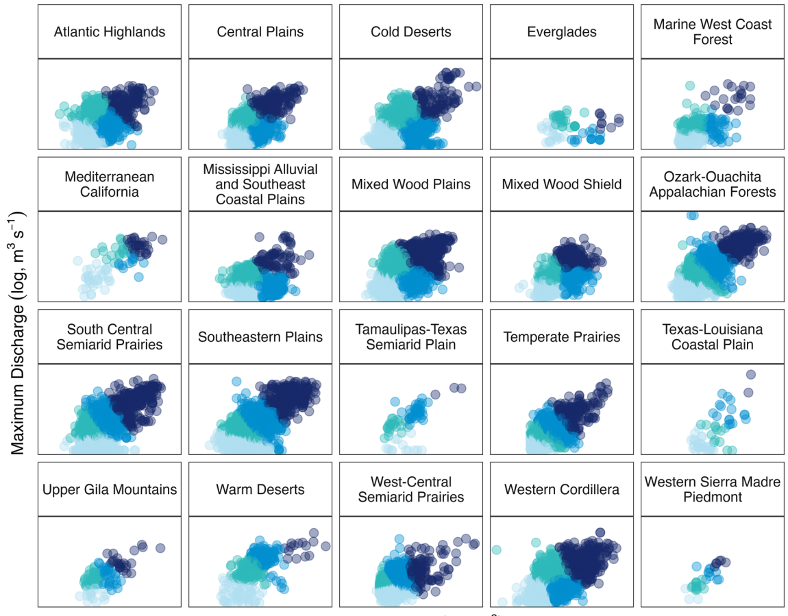
Storage Volume (log, m<sup>3</sup>)

Figure 2. Results from k-means analysis by ecoregion using 4-cluster separation on USA reservoir discharge (log, m^3 s^{-1} ) and storage volume (log, m^3 ) (n = 36,340). Clusters represent reservoirs with small volume and low discharge (light blue), small volume and high discharge (turquoise), large volume and low discharge (medium blue), and large volume and high discharge (dark blue).