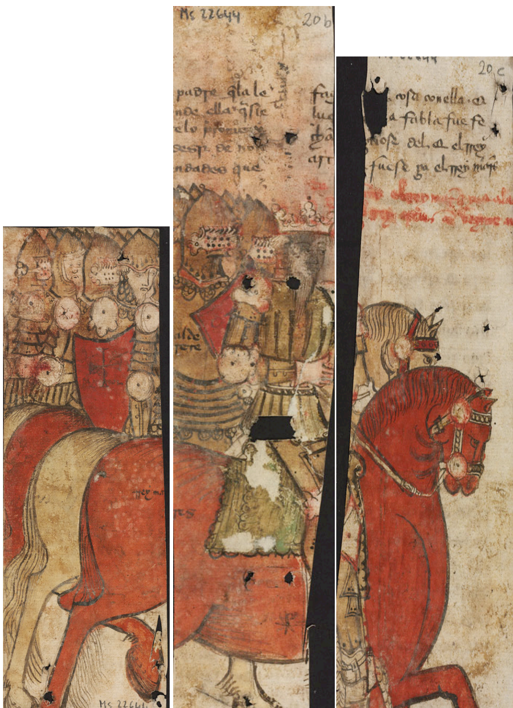
Figure 5. BNM Mss./22.644.20abc