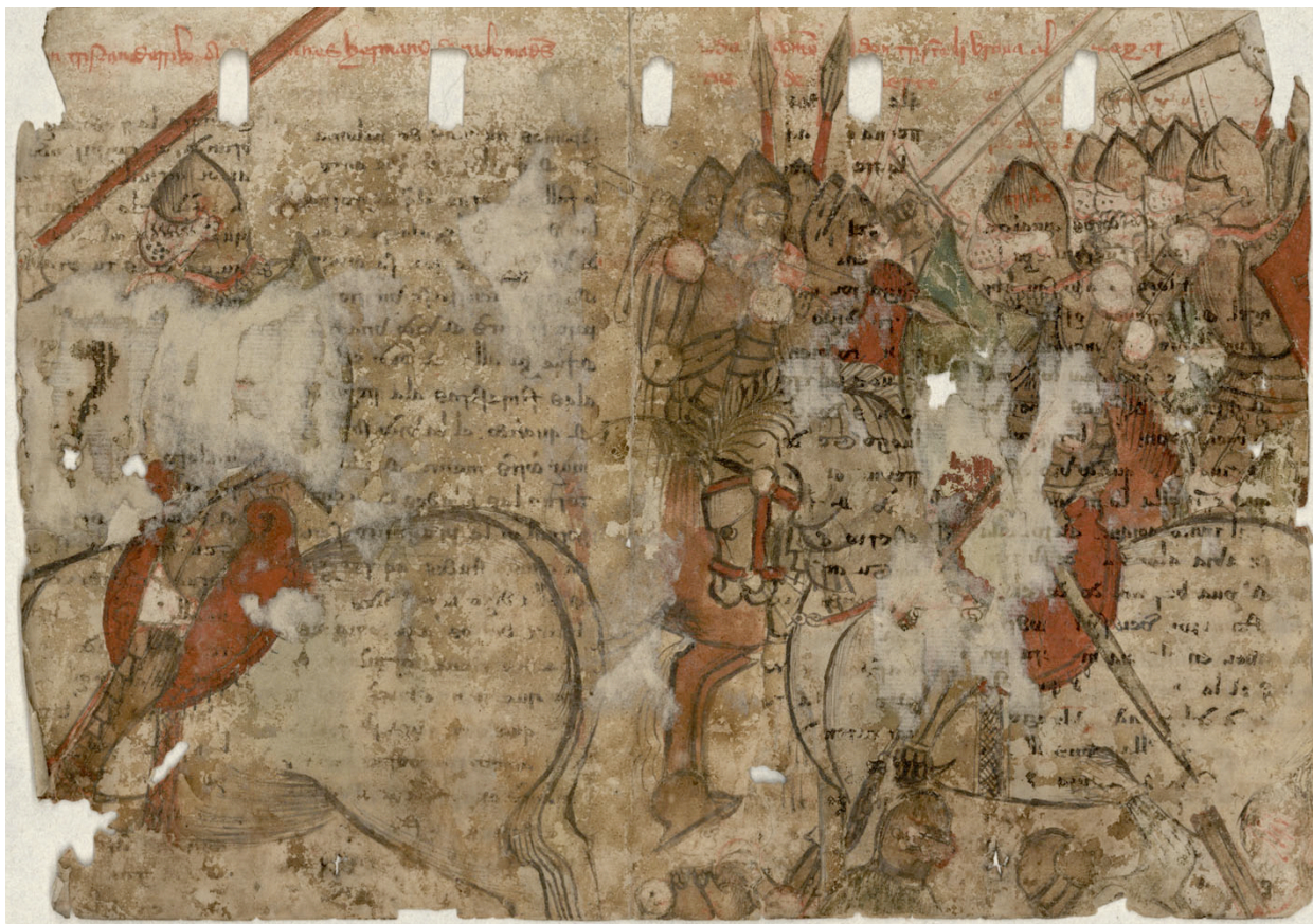
Figure 1. BNM Mss./22.644.9ab