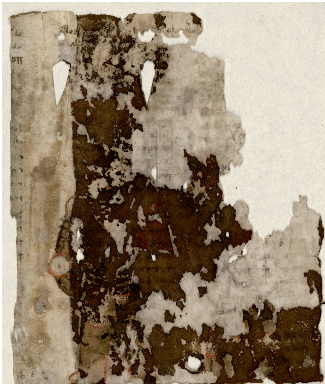
Figure 3. BNM Mss./22.644.17