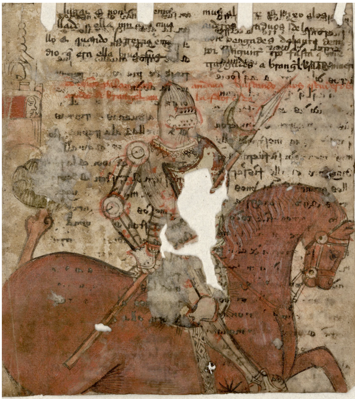
Figure 7. BNM Mss./22.644.6b