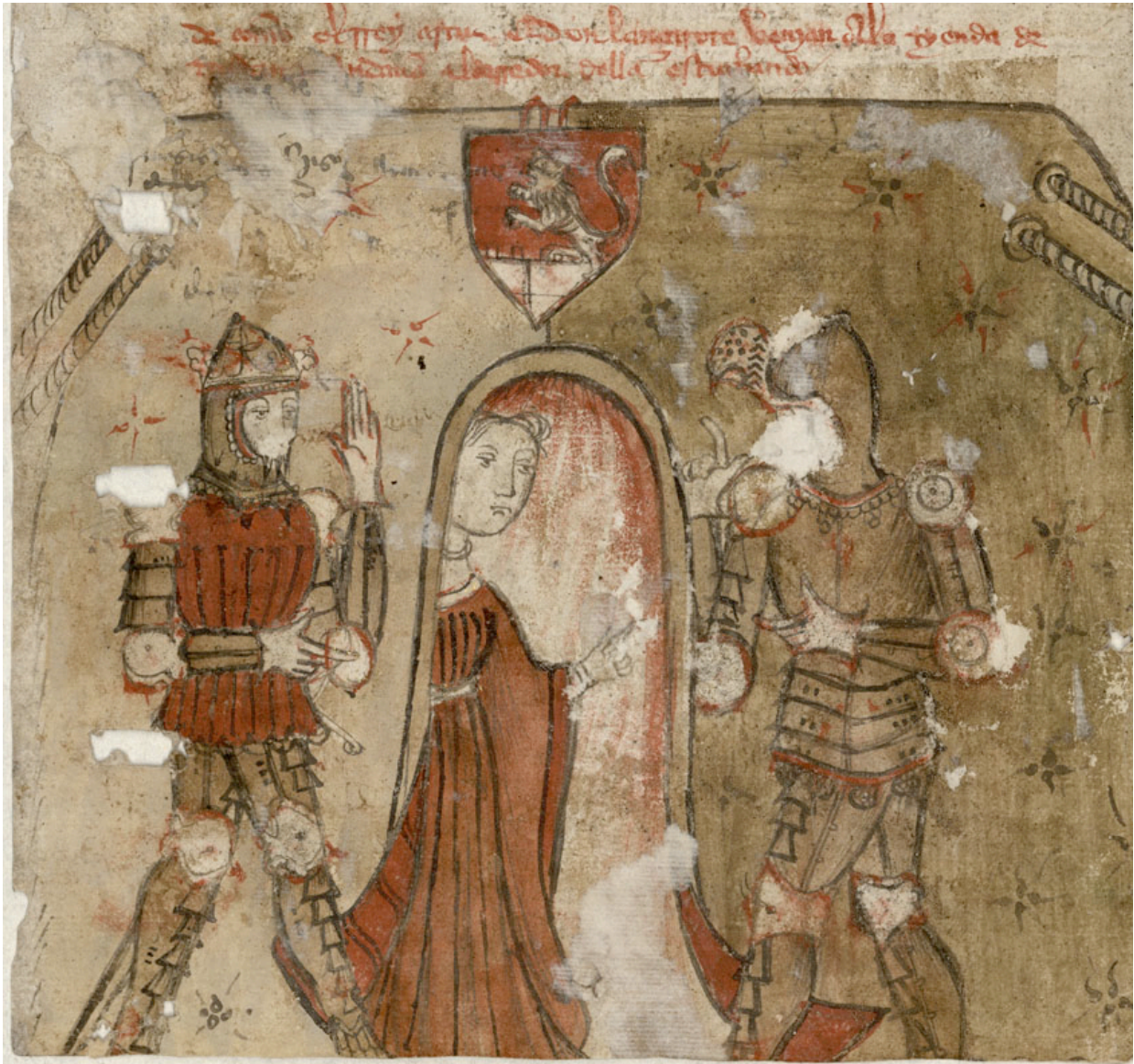
Figure 2. BNM Mss./22.644.14