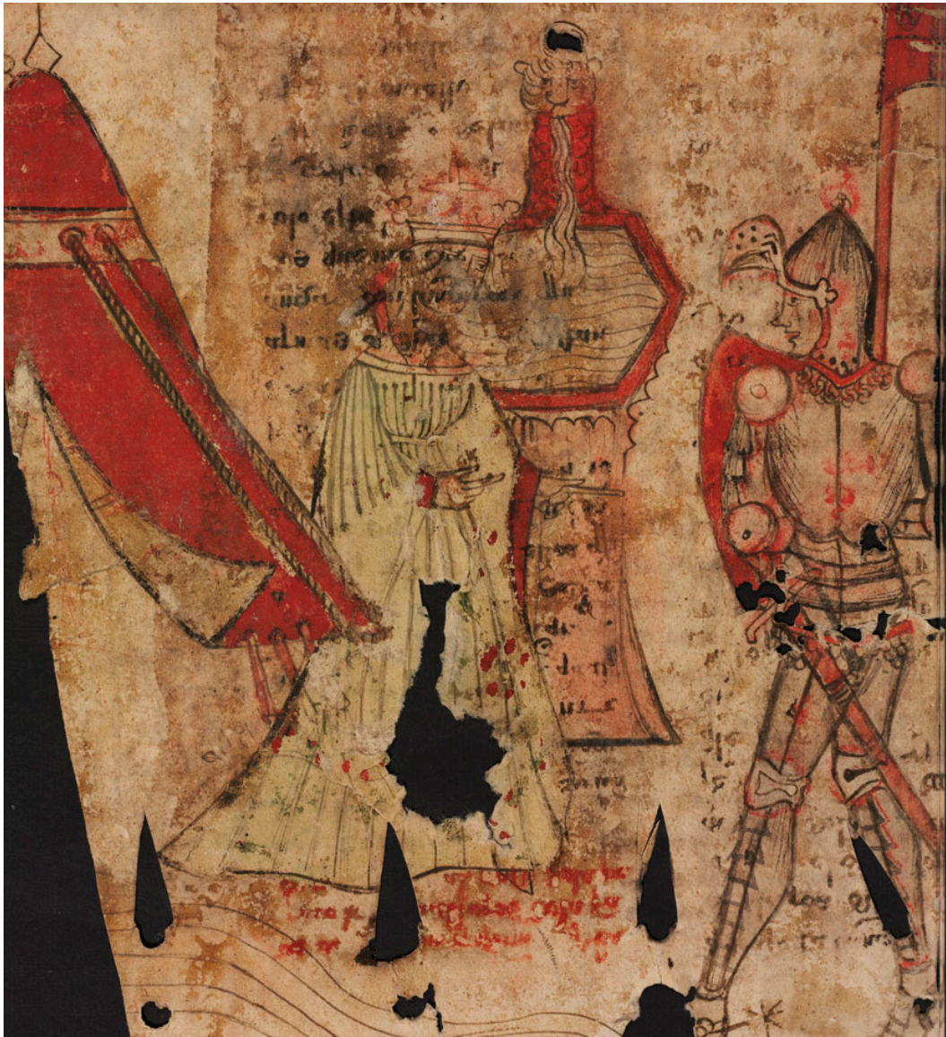
Figure 8. BNM Mss./22.644.8