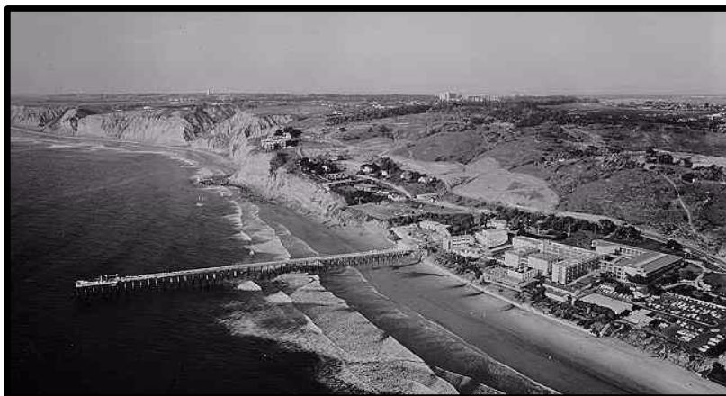
Scripps Institute of Oceanography and the new UCSD campus in the background, 1966.