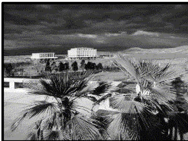
The new campuses at Irvine (left) and Santa Cruz opened to students in 1965 amid a building frenzy and projections of large scale enrollment growth. Here the two campuses are shown in 1968 with temporary trailers (background) shown on the Santa Cruz campus.