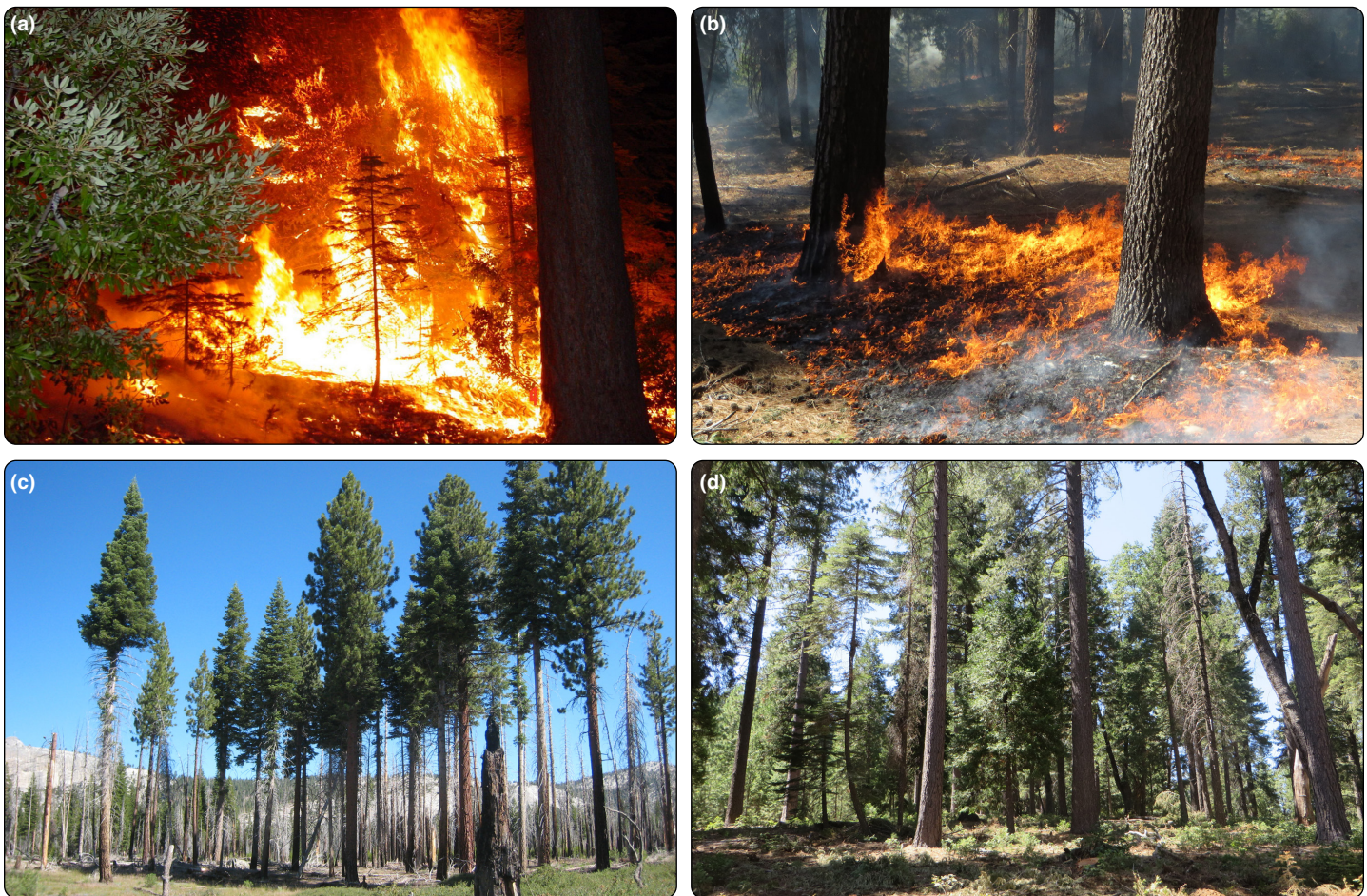
Figure 2. Fire and restoration thinning treatments in mixed-conifer forests in the Sierra Nevada, California. (a) First entry prescribed fire in 2002, with high forest density and small trees burning; (b) similar area in the same experiment illustrated in (a) after three prescribed fires (2002, 2009, and 2016) showing restored forest conditions (see Collins et al. [2014] for details on experiment); (c) wilderness site in Yosemite National Park that was burned by lightning-ignited wildfire and was managed for positive ecological objectives (Collins et al. 2009); and (d) multiple restoration thinning treatments (2001 and 2019) showing reduced tree density and surface fuels in the same experiment as depicted in (a) and (b).

areas, and hardwoods (deciduous trees) and shrubs could minimize short-term effects on species of concern so that the long-term benefits of restored forest ecosystems are realized (Figure 3; Churchill et al. 2013; North et al. 2017).