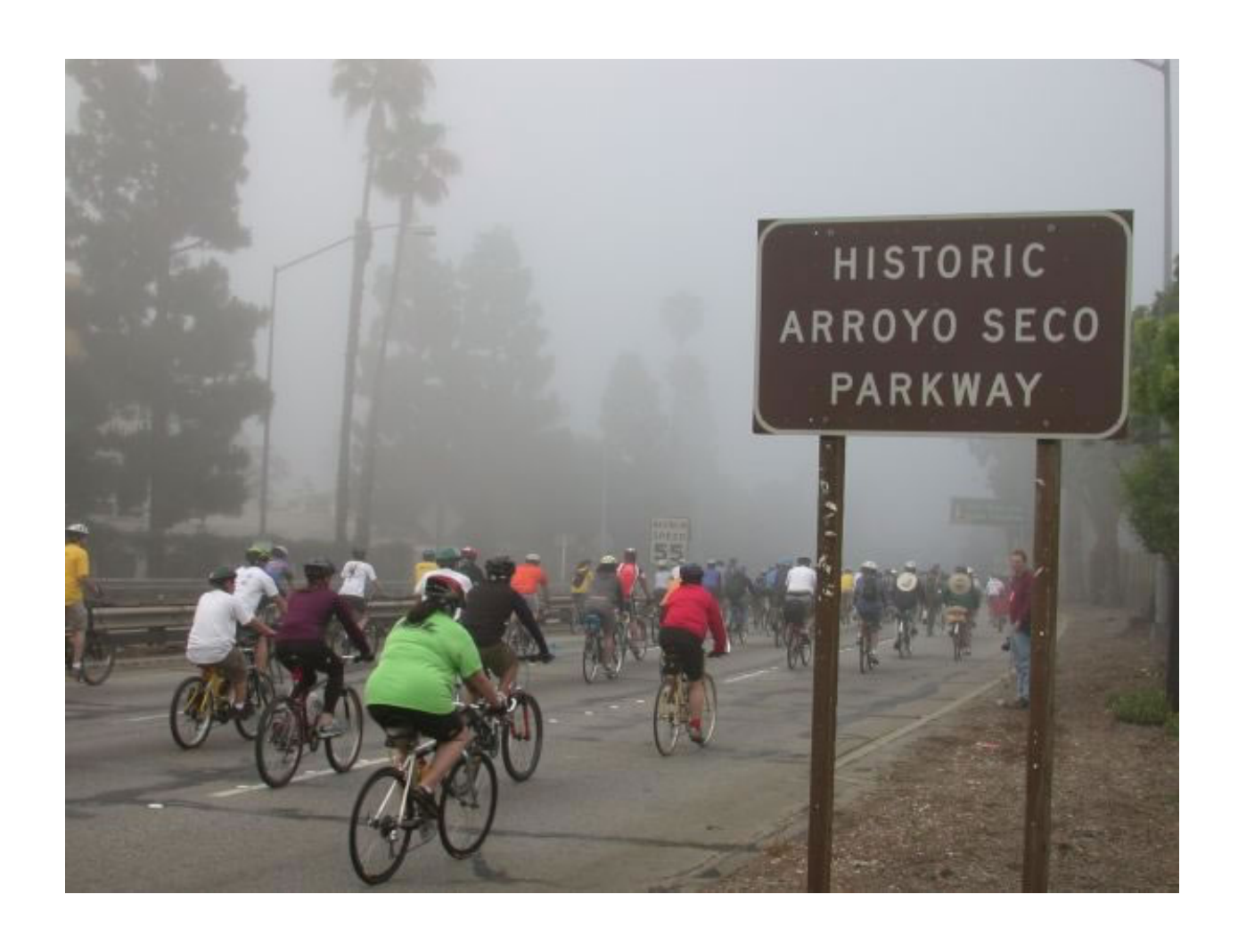
Figure 2: Bikers riding on the parkway during ArroyoFest