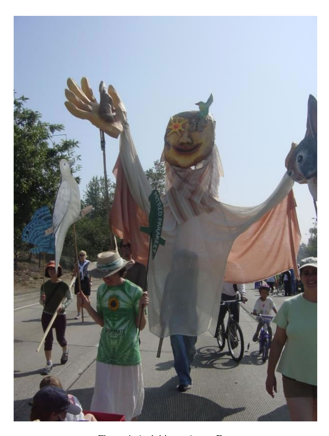
Figure 4: Activities at ArroyoFest