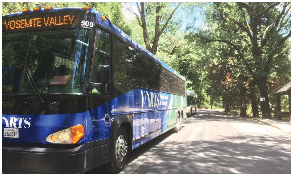
FIGURE 5. A Yosemite Area Regional Transportation System bus in Yosemite NP that helped the park reduce carbon emissions per visitor 10% from 2008 to 2011 (Villalba et al. 2013).

US national parks have implemented emissions reduction actions. Yosemite NP reduced greenhouse gas emissions per visitor 10% from 2008 to 2011 through energy conservation, energy-efficient lighting, solar energy, recycling, water conservation, and public transportation (Villalba et al. 2013). Greenhouse gas emissions inventories of 18 national parks showed that visitor cars produced 75% of park emissions (Steuer 2010). Yosemite NP helped to set up a regular bus route from the nearest Amtrak rail station to Yosemite Valley (Figure 5) and shuttle buses within the park that