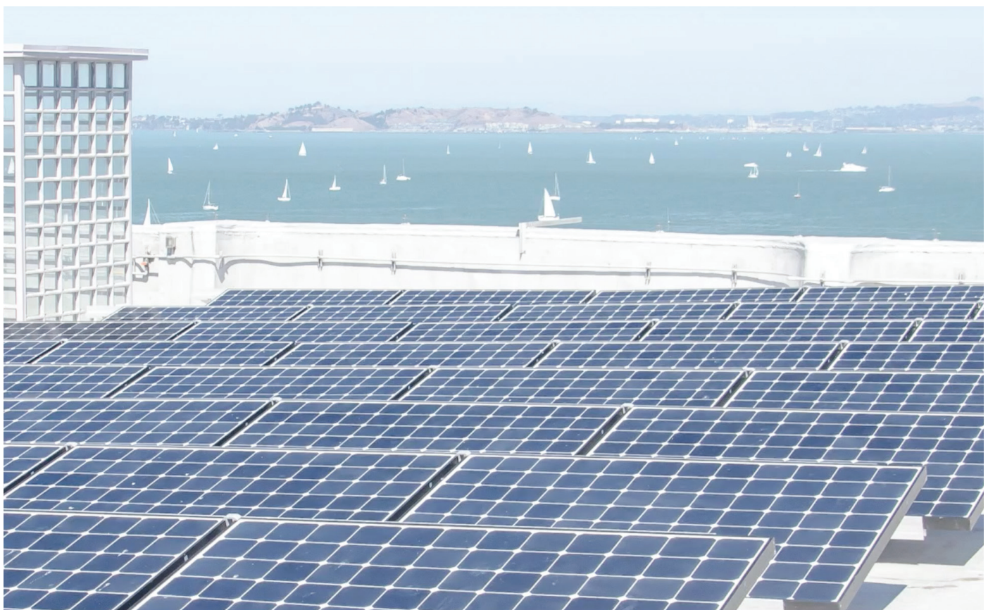
FIGURE 6. Solar energy array on Alcatraz Island in Golden Gate NRA that helped the park reduce carbon emissions 25% from 2010 to 2015 (NPS 2016).

Reducing CO 2 emissions can avert the most extreme temperature increases in national parks in the future. The IPCC emissions reduction scenario (RCP2.6), in which the world would meet the Paris Agreement goal, would lower projected heating in national parks by two-thirds by 2100, compared with the highest emissions scenario (RCP8.5) (Gonzalez et al. 2018). The reduced heating could produce substantial benefits on the ground. While the highest emissions scenario puts 16% of plant and animal species globally at risk of extinction, the risk drops to 5% under the emissions reduction scenario (Urban 2015). Similarly, global sea level could rise 84 cm (33 in.) under the highest