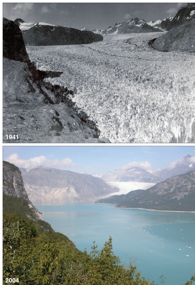
FIGURE 2. Muir Glacier, Glacier Bay NP on August 13, 1941 (photo William O. Field, courtesy of the National Park Service, National Snow and Ice Data Center, and US Geological Survey) and on August 31, 2004 (photo Bruce F. Molina, courtesy US Geological Survey). Photos aligned by P. Gonzalez. From 1948 to 2000, climate change melted 640 m in depth from Muir Glacier at its lowest extent (Larsen et al. 2007; Marzeion et al. 2014).

Across the southwestern US, the increased heat and aridity of human-caused climate change account for half the magnitude of a regional drought from 2000 to the present that has been the most severe drought since the 1500s, reducing soil moisture to its lowest levels since that time (Williams et al. 2020). In California, the most severe drought in a century of weather station measurements occurred from 2012 to 2016, caused by the hottest annual average temperature in the period 1896–2014 and near-record low rainfall and snowfall (Diffenbaugh et al. 2015). The high temperatures of climate change accounted for one-tenth to one-fifth of the magnitude of the California drought (Williams et al. 2015). In the Colorado River Basin, the high temperatures of climate change have combined with low rainfall and snowfall to cause a drought from 2000 to the present that is the most severe since the start of weather station measurements in 1906 (Udall and Overpeck 2017; Xiao et al. 2018).