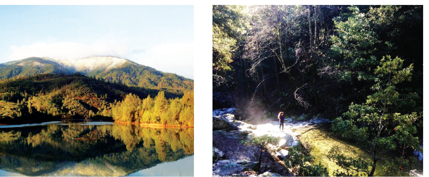
Scenes from Whiskeytown National Recreation Area: (left) Whiskeytown Lake; (right) hiker in sunlight.

EP: Teachers are part of the experience as participants in their own right. For one, they get to observe others teach their students. Teachers never get enough opportunities to observe other educators. In this environment, they get a chance to be less involved in the direct instruction at camp and observe their students and maybe learn some new approaches and techniques from the field staff. At Whiskeytown, teachers are especially eager to see Next Generation Science Standards in action. They see how engaged and excited their kids are and that inspires their own excitement. So, the fact that our programs align with their curriculum is a benefit, and teachers gain confidence in their own ability to approach science teaching in a new way. They get to know their students better, including discovering strengths they may not have been aware of. Teachers return to the classroom renewed and inspired, with a wealth of material to draw from and build on throughout the year.