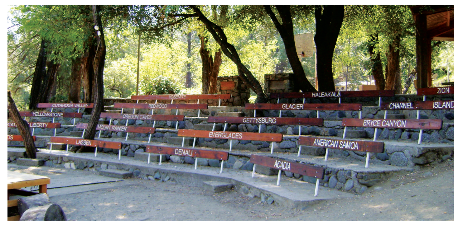
Benches inscribed with names of national parks in the amphitheater at Whiskeytown Environmental School.

EP: Sure! In a typical Whiskeytown Environmental School experience, kids show up and get off the bus, and even though they are only 12 miles west of Redding, from their excitement, you would think they had just set foot in another country. They are amazed and have heard about this place from parents, siblings, and friends, so the experience has become a rite of passage, long anticipated. For the next five days, their world is the camp. They sleep in these tiny, old cabins, which have a legacy in the community. When people come up to us, they say, "I remember the number of my cabin, I was in Cabin 11!" They remember this place for the rest of their lives! Cabin groups are named for national parks; there is a Yellowstone, Yosemite, and a lot of lesser known parks as well, such as Lassen and Channel Islands. This becomes their group identity, so when they gather at the outdoor amphitheater for songs and campfires, they sit on benches inscribed with the same park name. On the final