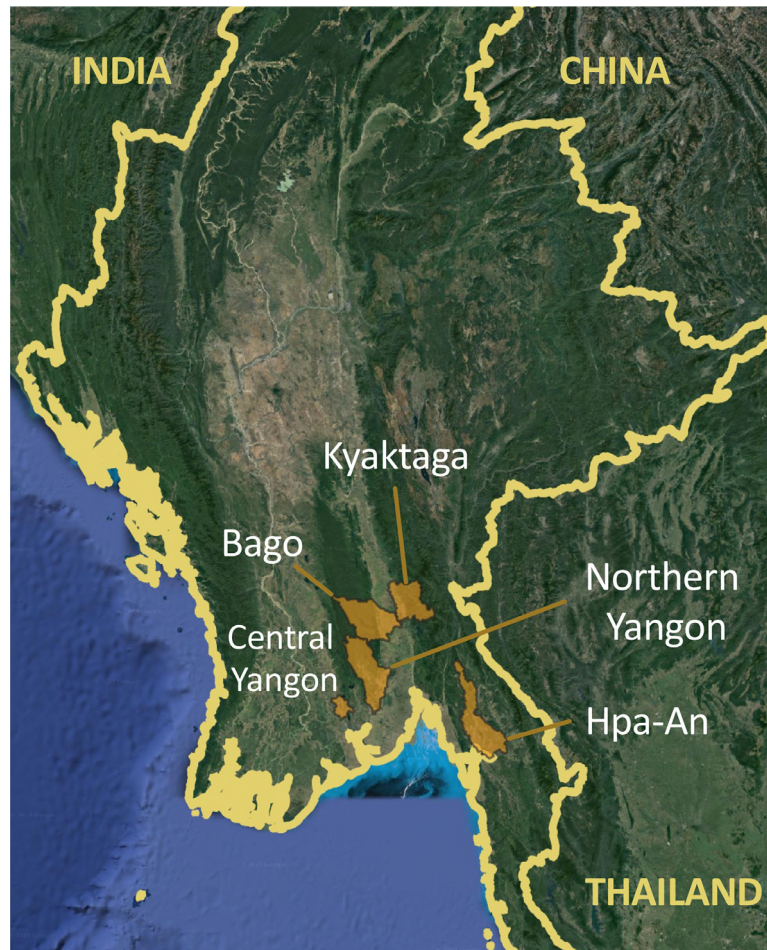
Figure 1. Locations of human communities within Myanmar.

30% signal inhibition. The percent signal inhibition for the detection of NAbs was calculated as: