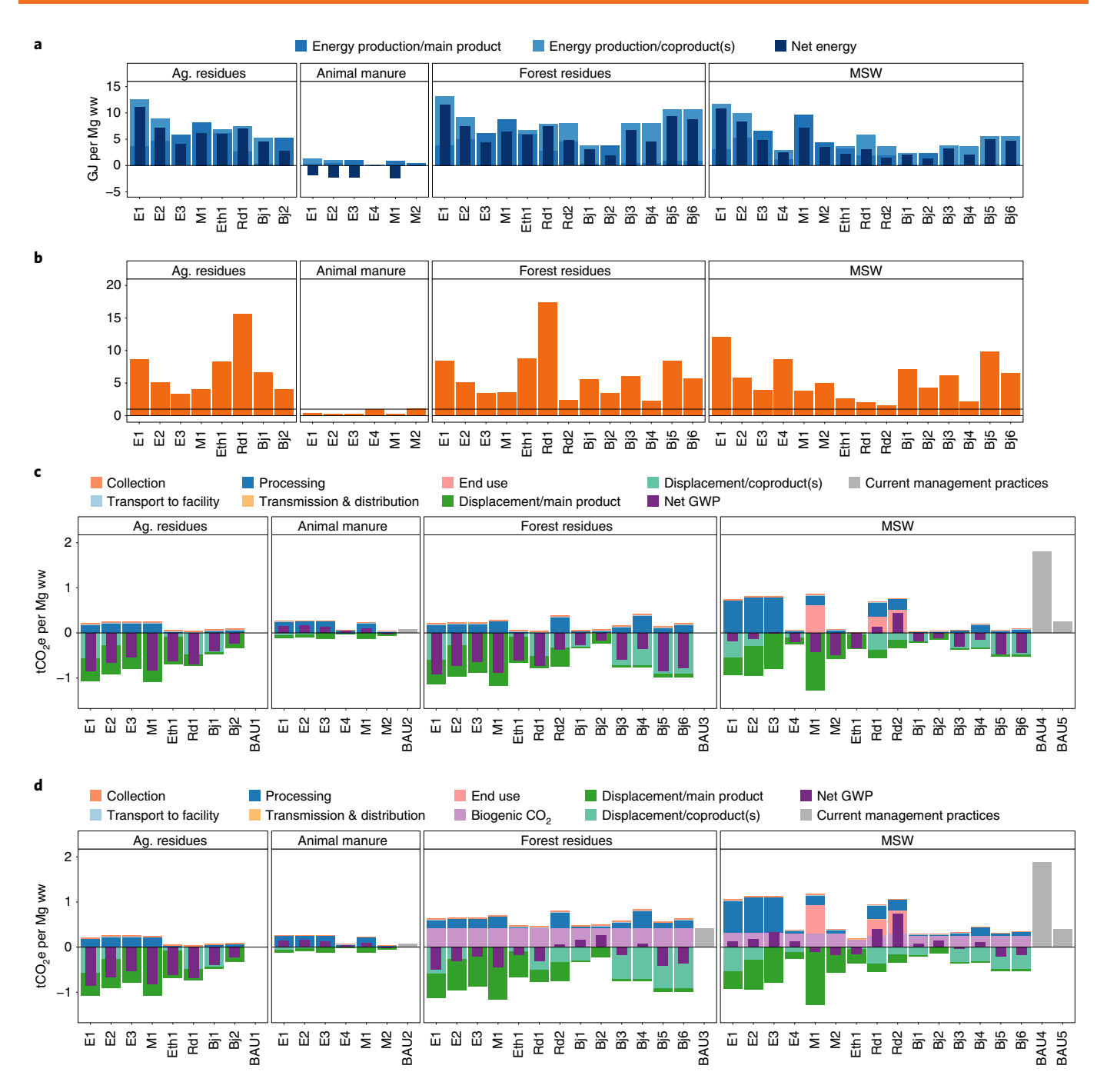
Fig. 1 | Energy, net energy and emissions from waste biomass utilization in the United States. a , Energy production and net energy by waste type and conversion pathway. b , Energy return on investment by waste type and conversion pathway (the horizontal line refers to an energy return on investment of 1). c , Life-cycle emissions when biogenic CO<sub>2</sub> is excluded. d , Life-cycle emissions when biogenic CO<sub>2</sub> is included. ww, wet weight. Electricity pathways: E1—CHP, E2—gasification + CHP, E3—integrated gasification combined cycle, E4—anaerobic digestion + CHP. Methane pathways: M1—gasification, M2—anaerobic digestion. Ethanol pathway: Eth1—enzymatic hydrolysis + fermentation. Renewable-diesel pathways: Rd1—gasification + FT synthesis, Rd2—pyrolysis + hydroprocessing. Bio jet fuel pathways: Bj1—alcohol-to-jet (ethanol), Bj2—sugar-to-jet (fermentation), Bj3—pyrolysis (in situ), Bj4—pyrolysis (ex situ), Bj5—HTL (in situ), Bj6—HTL (ex situ). Business-as-usual (BAU) practices: BAU1—left on field (agricultural residues), BAU2—direct land application (animal manure), BAU3—burning on site (forest residues), BAU4—landfilling without methane flaring or capture (MSW), BAU5—landfilling with 75% of methane capture and use for on-site CHP (MSW). See Table 1 for additional details of conversion pathways.

description in Table 1) and 29 waste feedstocks with spatially explicit estimates of waste potential for the United States. We find that the source of electricity consumed during processing and the environmental footprint of the displaced products are key in determining the best use of wastes and biomass residues. The utilization of all available wastes and residues in the contiguous United States can