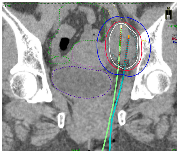
FIGURE 2 | A coronal CT image of the bulkiest obturator node (blue dashed line), uterus (pink dashed line), bowel (green dashed line), external iliac vessel (yellow dashed line), bladder (purple dashed line) receiving 50% (blue lines), 100% (red lines), and 150% (white lines) of the prescription dose (6 Gy) from two implanted needles.