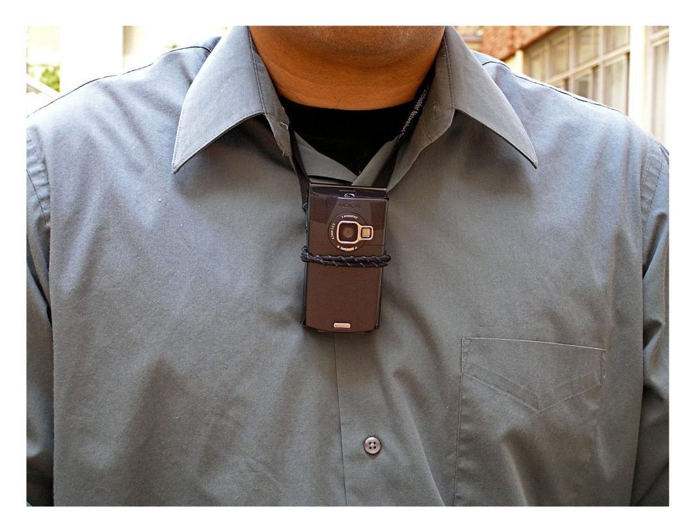
Figure 2. Image of the Mobile Phone An image of participant wearing camera-embedded used in study.