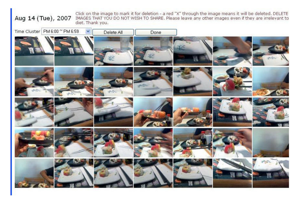
Figure 4. Example of Presentation of Food Images for Subject Review A web-based ImageViewer was used by participants to access images after filtering; participants could then delete images deemed private from the public record.