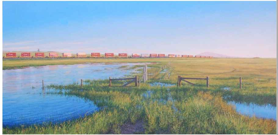
Ivey – Summer on the Main Line