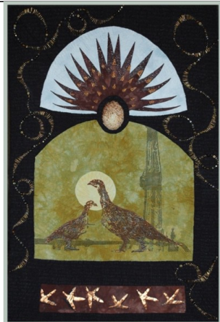
Palma – Sage Wars