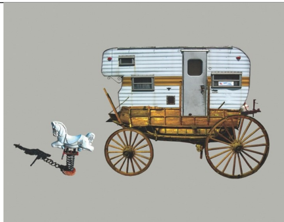
Vetter – Camperwagon #1: Horse Americana