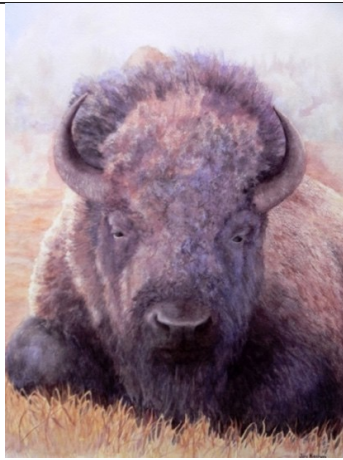
Keown – Buffalo Bull