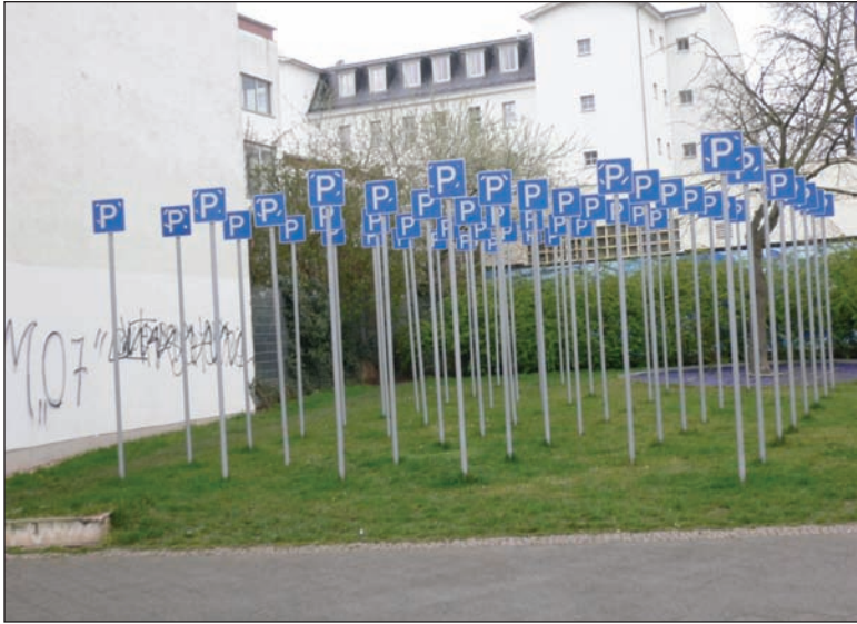
Illustration 4: Stattpark, an art project sponsored by Urban II.