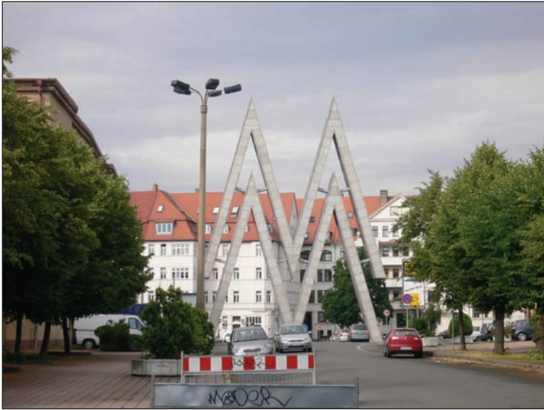
Illustration 3: Leipzig as the “Messenmetropole”. A part of the street furniture, a symbol of identity.