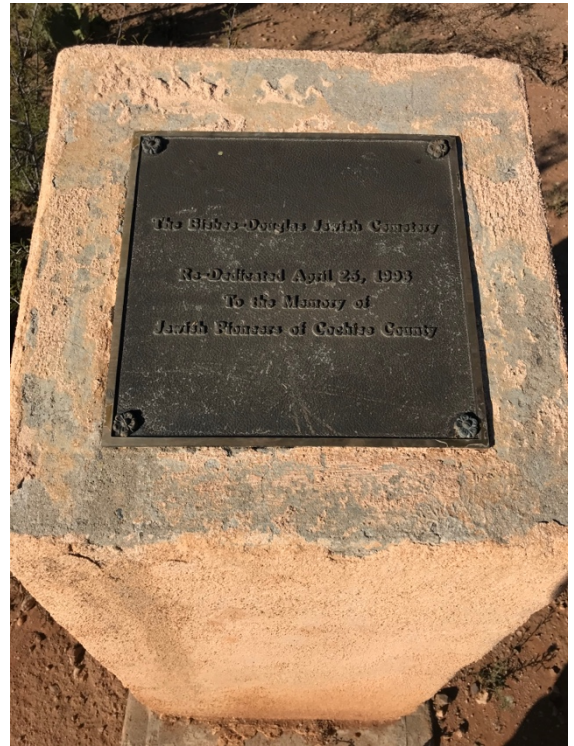
Figure 3: Re-Dedication Plaque, 1993. Image courtesy of author, November 2018.

Just as the economic model of Jewish preservation and continuity works with, and reflects the ideologies neoliberal capitalism, the results of the preservation efforts also reflect liberal mythologies about European settlement. In 1993, when the Bisbee-Douglas Cemetery was still under the ownership of Congregation Anshei Israel, the University of Arizona Hillel Foundation, and the Bloom Southwestern Jewish Archives (part of UA's Special Collections Library) launched a re-dedication project; both the Hillel and the Bloom archives are designated 501(c)(3)s and categorically Jewish American institutions dedicated