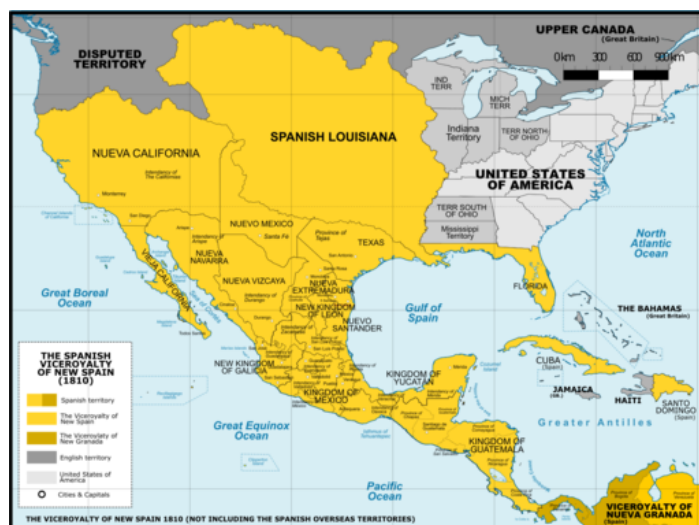
Figure 1: Viceroyalty of New Spain, 1810.

In the following pages, I argue that existing historiographies of Jews in North America, particularly in geographically linked, but temporally disparate spaces like northern New Spain, US-Mexico border region, and the American West, benefit from a settler colonial framework in several ways. Not only does this offer an initial step toward unlearning the liberal paradigms embedded in Jewish Studies, but also offers a methodology for how Ethnic Studies frameworks help make meaningful connections between anti-Semitism and other forms of anti-Black, anti-Indigenous racism.