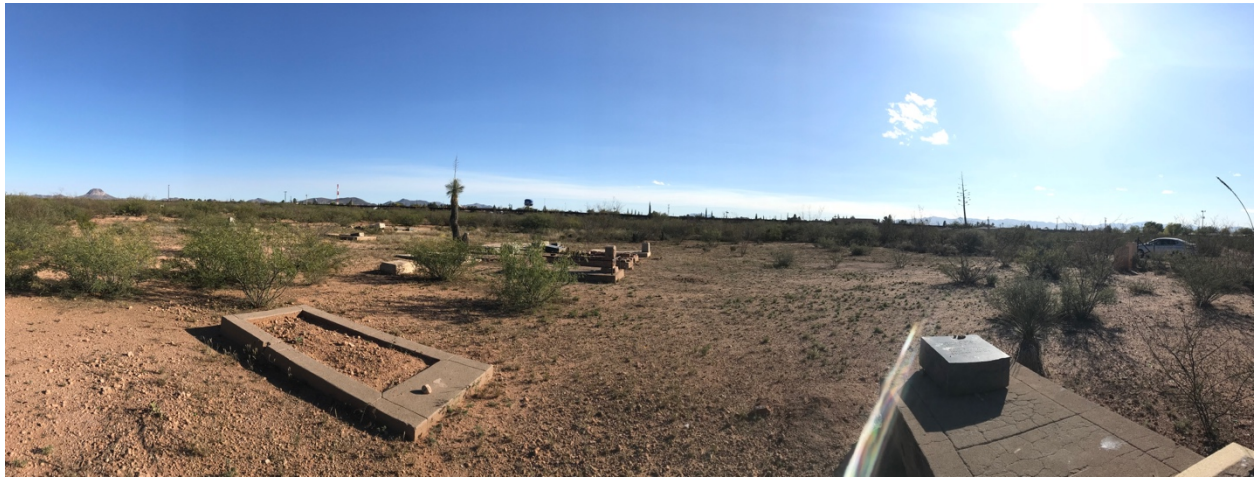
Figure 1: Image of the Bisbee-Douglas Jewish Cemetery. US-Mexico border wall and Agua Prieta (Sonora) water tower visible in background. Photo courtesy of author, November 2018.

At the turn of the twentieth century, the members of the Sons of Israel Congregation in Douglas, Arizona purchased a plot of land in which the town's Jewish deceased were to be buried. By some regional historical accounts, this purchase signified the creation of the first exclusively Jewish cemetery in the Arizona Territory. 1 The Jewish burial ground was built on the ancestral homeland of the Chiricahua Apache, who since the sixteenth century, had resisted invasions by military and civilian settlers under Spanish and Mexican rule. In the decades following the Treaty of Guadalupe Hidalgo (1848) and the Gadsden Purchase (1853), US imperial state formation produced permanent military occupation, the transcontinental railroad, and the expansion of extractive capitalist industries, which together worked to eliminate Apache