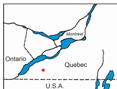
Figure 1. Map shows the songbird monitoring site at Montée Biggar, Québec. The red dot indicates the location of an established population of blacklegged ticks and associated Lyme disease endemic area.

Ticks were collected from songbirds during the period 8 June to 2 August 2019 at Montée Biggar (45.088226° N, 74.215678° W) in southwestern Québec, Canada (Figure 1). Live ticks were collected from passerines using hardened stainless steel, #5, superfine-tipped forceps (BioQuip Products, Rancho Dominguez, CA). Live ticks were put into a transparent 8.5 mL, 15.7 mm × 75 mm, round-bottomed polypropylene tube (Sarstedt, Montréal, Québec, CA); each tube contained ticks from a single host. In order to keep live ticks from escaping, a piece of tulle netting (3-cm diameter) was placed over the mouth of the tube, and a push cap, which had a 7-mm hole, was promptly inserted into tube opening. This technique prevented live ticks from escaping and, at the same time, provided ventilation for live ticks. For mailing, polypropylene tubes were put in a double-zipper plastic bag with slightly moistened paper towel to sustain high humidity. All ticks were sent directly to the lab (J.D.S.) for identification. Live, partially and fully engorged larval and nymphal ticks were held to molt (metamorphose to the next developmental life stage) to confirm the species identification and, in certain cases, reveal transstadial passage of tick-borne, zoonotic pathogens.