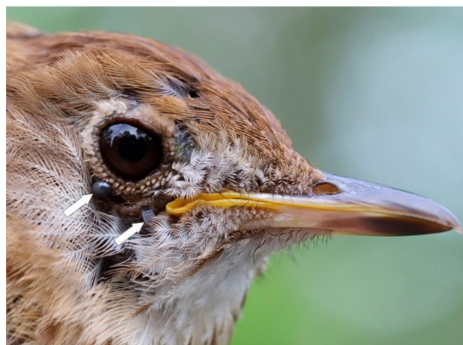
Figure 4. Veery, after-second year male, infested with three I. scapularis nymphs. One fully engorged nymph moulted to a male in 31 d. On 22 July 2019, this bird was moulting to prepare for the southward flight to its wintering range in Brazil.

One Veery was co-infested with H. leporispalustris (one nymph and one larva), and I. scapularis (two nymphs). Not only is there a breeding colony of I. scapularis present in this Laurentian River basin, an established population of H. leporispalustris is also there. Since these ixodid ticks were collected during the nesting and fledgling period, this bird parasitism denotes a cohabitation of two tick species in this sylvan locale, and signifies that these two tick species are sympatric. The Veery has trans-border and trans-equatorial migration during its northward spring flight, and has a breeding range in southern Canada, including southwestern Québec and northern United States; the wintering range is in central and southeastern Brazil (Figure 4). During the breeding, nesting, and fledgling period, Veeries have localized activity in juxtaposition to the stationary nest. When the young have fledged the nest, these passerines replenish their fat reserves, and prepare for the southbound trek to wintering ranges in southern latitudes during August and September. In late July, they typically moult in preparation for the southbound marathon flight.