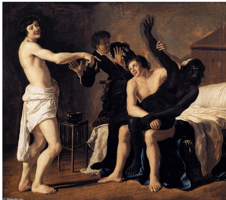
Figure 5. Christiaan Van Couwenbergh's Rape of the Negro Girl (1632)

painting so grotesquely, even monstrously to say the least, frames her and all black women everywhere at that time as non-human. Subliminally, this suggests to the viewer that the woman in the painting and quite reasonably all black women everywhere then warranted being attacked by several white men at a time. This is a distorted mindset that perhaps assists to more adequately frame the rationale of the four white men who raped Ailey's mother in rural Texas during the 1930s as well as remembering so many other cases like it before and after.