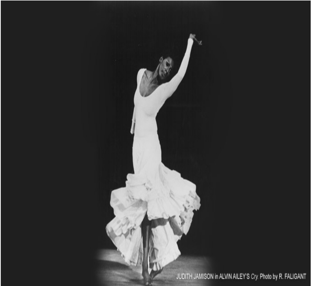
Figure 1. Judith Jamison in Cry