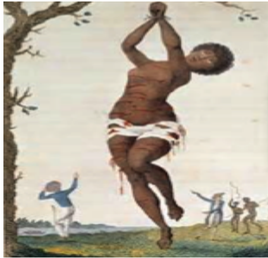
Figure 8. Flagellation of a Female Samboe Slave (1796) 36