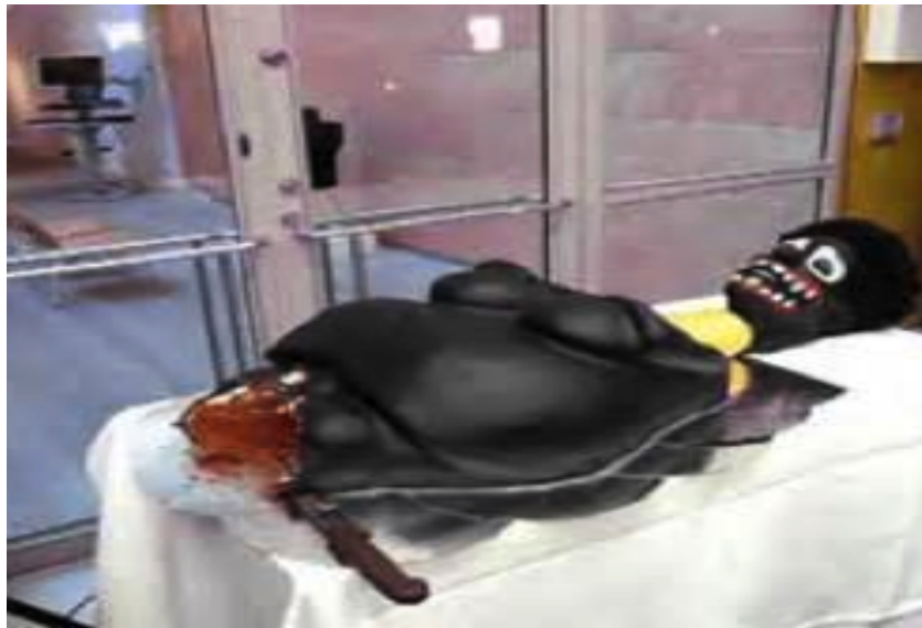
Figure 9. Swedish Internet source unknown #1.