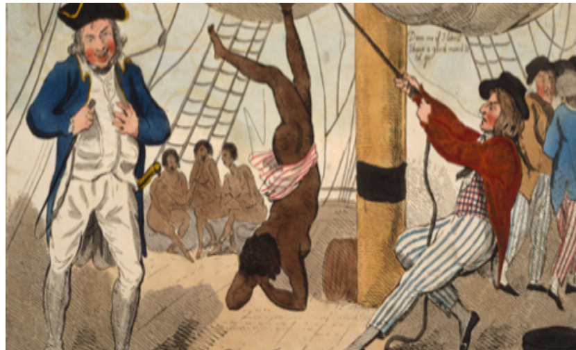
Figure 7. Punishment Aboard a Slave Ship (1792)

these unpleasant histories or those who might argue that these events transpired a long ago and aren't relevant now, they should consider the implications behind the following images where a black woman's body is cake as well as the only part of the cake that was sliced and consumed was the vagina. This is why recalling these examples of literary and visual works of art are once again relevant to the way that Ailey chose to choreographically pay homage to his mother as well as what were his ideas about black femininity. Mainly because it establishes that Cry wasn't a random artistic thought in 1971 without a concrete basis for artistic work esteeming black womanhood, and because it also establishes that Ailey isn't just thinking about this in a vacuum. He was instead very likely responding artistically to a centuries old practice of dishonoring black women in every gruesome way imaginable and then disavowing it in the effort to historically forget it ever happened.