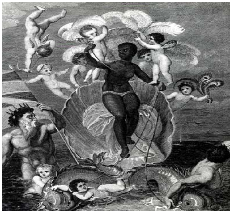
Figure 6. Thomas Stothard's The Voyage of the Sable Venus from Angola to the West Indies (1801)

large oyster shell as if she is a precious jewel, a black pearl to be exact. Therefore Stothard's efficacy in illustrating the black woman's body attractive and inviting in this piece, unlike Couwenbergh's, is due to the fact that his painting imagines black femininity as a visual metaphor for the profitability of slavery which was considered beautiful. More especially because slave ships sailing West with human cargo represented how the society as a whole was also being psychologically and sociologically ushered into western society in large part through questionable Christian values and seventeenth century artistic propaganda and beyond.