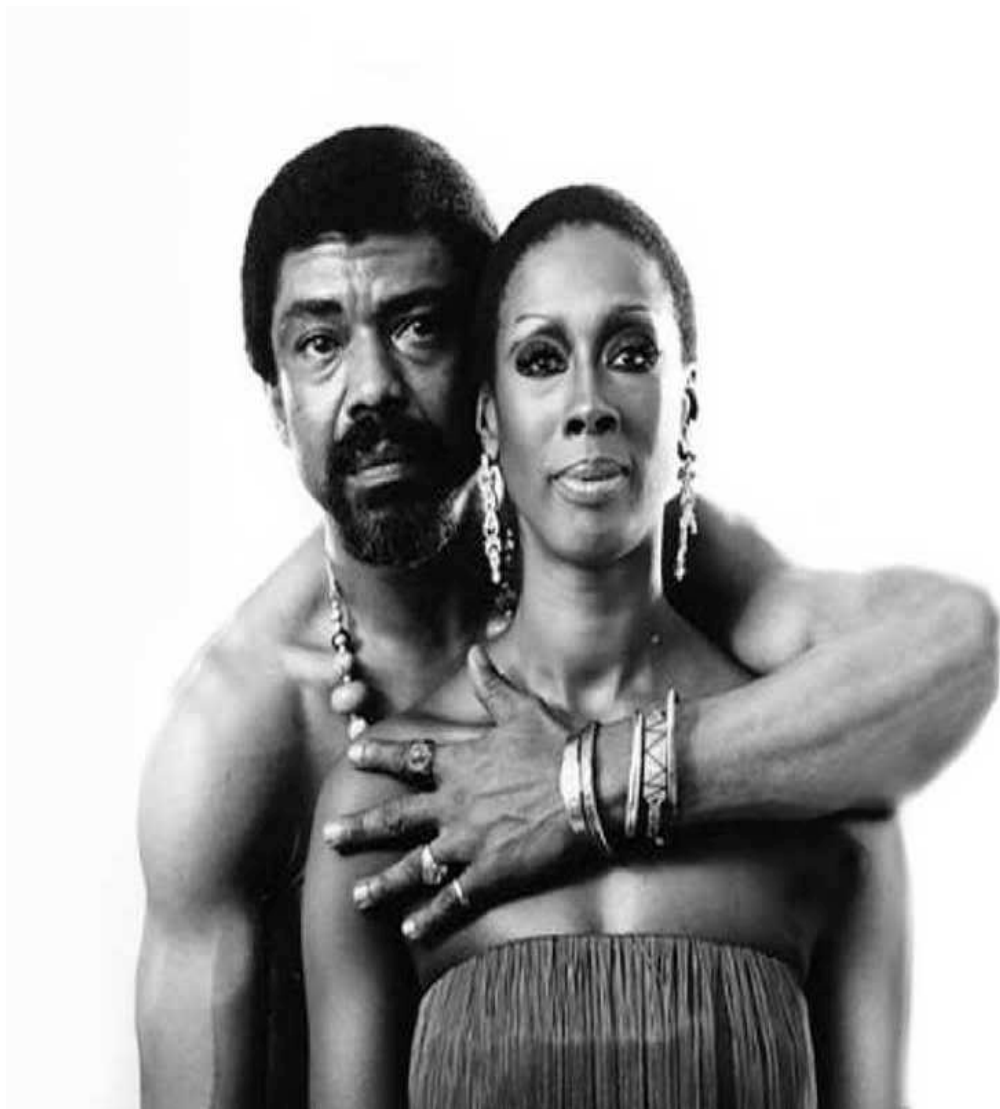
Figure 1. Alvin Ailey and Judith Jamison