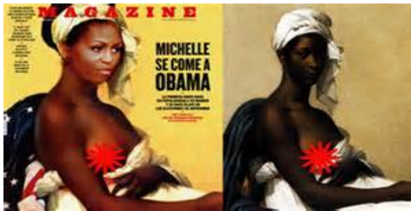
Figure 2. First Lady Michelle Obama next to Portrait of a Negress (circa 1800)

In late-eighteenth-century France, racial thinking as well as racist utterances in print and images, became increasingly normalized and naturalized. In this context, Benoist's portrait was no different from works by other artists who assumed a relationship between physical difference and cultural and national difference. Although Benoist's specific views on black people are unknown, there is little doubt that she believed in a hierarchy of classes and the races, as did everyone of the period regardless of their political persuasion. ... Nineteenth-century critical responses to Benoist's painting were varied, but reveal much about the then-prevalent attitudes towards race and gender. One reviewer, ... referred to the subject of Benoist's portrait as 'a sublime blurred tache ' (stain), 30 referencing the black woman as an unclean object, a blot devoid of noteworthy human presence. ( http://www.arthistoryarchive.com/arthistory/Slavery-is-a-Woman.html )