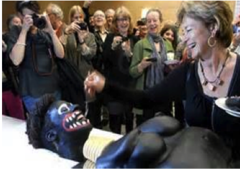
Figure 10. Swedish Internet source unknown #2.

This is why the analysis provided in this dissertation has consistently argued that Ailey's choreography in Cry is a performative statement. It is because Cry operates through Ailey's company legacy with a performativity that is always / already remembering how black women have survived being systemically raped and abused and continue to survive being forgotten and conveniently left out in various aspects of America History. It should also be noted that Ailey is doing all of this on a time line years before the formal organizing of the Black Feminist Movement in 1974.