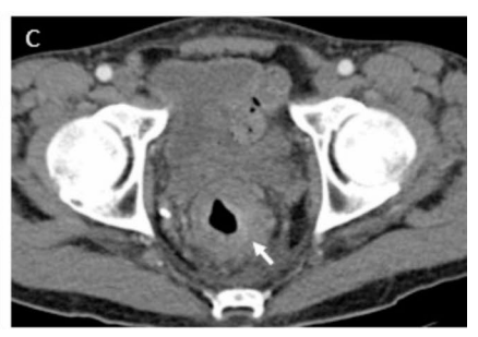
Fig. 1 Target lesion: Single organ dominant disease