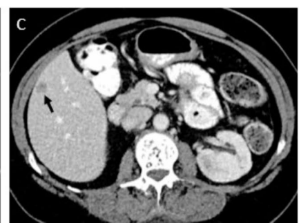
Fig. 3 Development of a new lesion

measurable new lesions to meet the same criteria as used for target lesions at baseline ( \geq 10 mm for solid lesions; \geq 15 mm short axis for lymph nodes) [7, 9]. Perhaps including these metrics into a RECIST 1.1 revision could result in a more cohesive interpretation of new lesion development and allow for further objective and prospective investigation as to the prognostic value of new lesions.