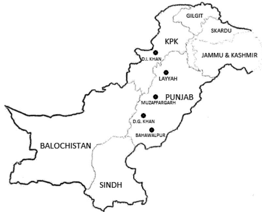
Fig. 1. Map of collection sites in Punjab and KPK provinces of Pakistan.