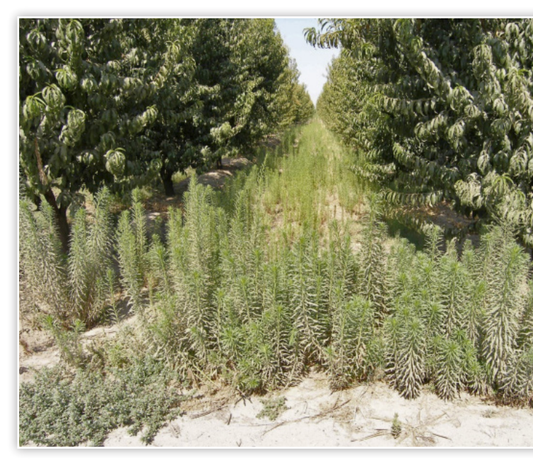
Figure 1. Stone fruit orchard in Fresno County, California, dominated by glyphosate-resistant horseweed. Reliance on one method of weed control imposes selection pressure on tolerant species or resistant biotypes.

Weedy plants can be tolerant of herbicides due to a variety of temporal, spatial, or physiological mechanisms. For instance, a weed may avoid control efforts if it emerges after a burndown herbicide is applied or completes its lifecycle before a postemergence herbicide is applied. Similarly, large-seeded or perennial weeds can emerge from deeper in the soil and may avoid germinating in soil treated with a preemergence