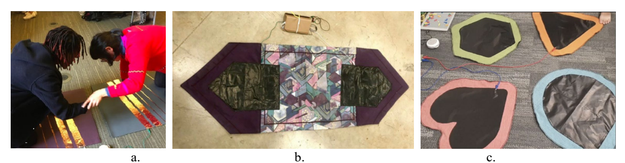
<u>Figure 2</u>. MMM design evolution: (a) Prototype 1: two users, who are each standing on a yoga mat overlaid with copper strips, spontaneously interact to produce emergent musical effects. (b) Prototype 2, equipped with velostat capacitors sewn onto fabric. (c) Prototype 3, a modular design increases affordance versatility.

The third prototype of MMM was modified as adaptable to different physical spaces—small or big—by creating several modular capacitive sensors that can be either pulled apart or placed close together (Figure 2c). This modification creates new interaction possibilities: (1) more than two people can now interact on the mat; (2) users can exercise agency in pulling the mats closer or further apart for different interactions; and (3) the flexibility of the design allows it to be used in different physical spaces. Prototype 3 affords new interaction dimensions to sound expressivity for our next iteration, such as accommodating multi-party interactions or augmenting the scope of touch-based gestures per distance between users. In turn, these new user affordances create new research affordances, such as investigating how architectural dimensions of artifact configurations effect modes of social interaction. Through our work with the autism clinic, we also noted the emergence of rhythmic hand games in the students' interactions. In our next iteration, we plan to include new hard/software functionalities for the augmentation of rhythmic gestures with percussion sounds that will be added to MMM's expressivity repertoire.