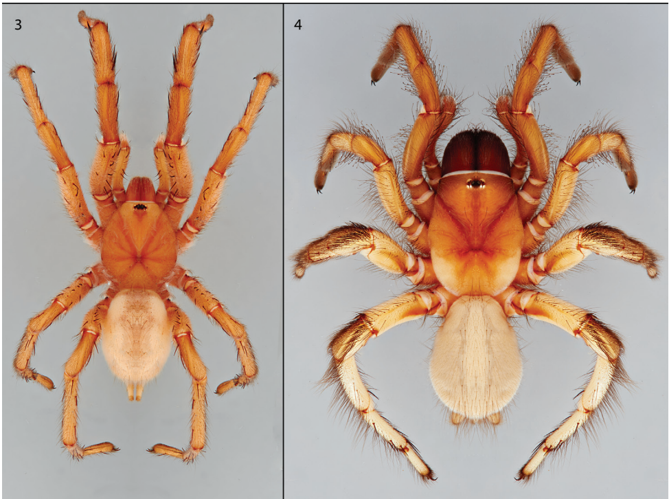
Figures 2–4. Habitus photograph and illustrations of Pionothele gobabeb sp. n. 2 Live male specimen 3 habitus digital illustration of male holotype specimen 4 habitus digital illustration of female.